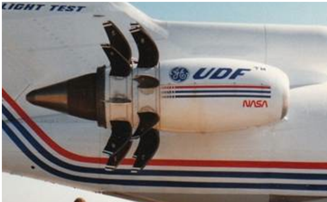
Figure 1- An example of contra-rotating open rotor design by GE

The high fuel prices of recent years have caused the operating cost of the airlines to soar. In an effort to bring down the fuel consumption, the major aircraft engine manufacturers such as GE, Rolls-Royce and CFM International are now taking a fresh look at open rotors for the propulsion of future airliners. Open rotors, also known as propfans or unducted fans, can offer up to 30 per cent improvement in efficiency compared to high bypass engines of 1980 vintage currently in use in most civilian aircraft. The lower fuel consumption of open rotors also contributes to the reduction of carbon emission into the atmosphere by airliners. Open rotor propulsion system can, therefore, be considered a Green engine. The single and contra-rotating open rotors are both under consideration for powering future aircraft. An example of a contra-rotating open rotor is shown in Figure 1 below.