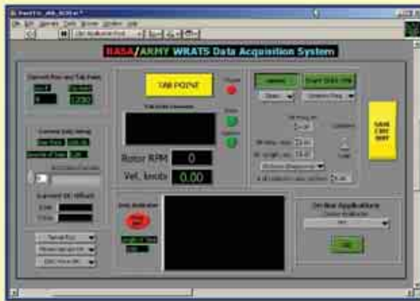
WRATS DAS front panel graphical user interface.

The WRATS model was tested with the DAS at the Transonic Dynamics Tunnel at NASA Langley. Shown below is the LabVIEW-based WRATS DAS front-panel graphical user interface.