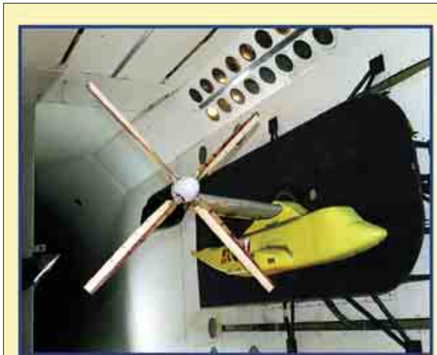
Wing and Rotor Aeroelastic Test System 9 (WRATS).

The aeroelastic model (see figure) was tested with the DAS at two facilities at NASA Langley, the Transonic Dynamics Tunnel (TDT) and the Rotorcraft Hover Test Facility (RHTF). Because of the need for seamless transition between testing at these facilities, DAS is portable. The software is capable of harmonic analysis of periodic time history data, Fast Fourier Transform calculations, power spectral density calculations, and on-line calibration of test instrumentation. DAS has a circular buffer archive to ensure critical data is not lost in event of model failure/incident, as well as a sample-and-hold capability for phase-correct time history data. The system has an interface to drive TDT text overlay display video monitors and an interface to trigger digital video recording