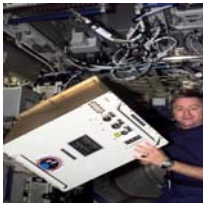
NASA Image: ISS003E6010 - Culbertson poses with MAMS hardware in the U.S. Laboratory during Expedition Three.