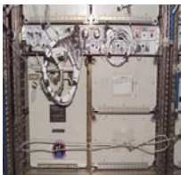
NASA Image: ISS013E65575 - Shown is the Microgravity Acceleration Measurement System (MAMS) used to measure acceleration during specific ISS operations. MAMS is located in EXPRESS Rack 1 in the U.S. Laboratory.