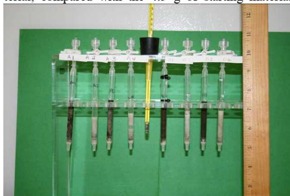
Figure 1. Photo of columns at end of experiment.

The columns reacted with the higher concentrations of acid were visibly bleached compared to the columns reacted with the lower concentration acids (Figure 1). Since mineral changes were more extensive in the columns leached with the more concentrated acids (0.1M), we focus on those columns here. When the heavily leached columns were weighed at the end of the experiment, each column contained less than 1.25g of material, compared with the 4.5 g of starting material.