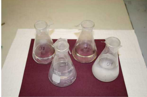
Figure 2. Photograph of precipitates in output solutions. Solutions are from “oxic” columns of the figure 1. A similar trend was seen for the anoxic columns.

Precipitates formed in the output solutions were visibly observed (Figure 2).