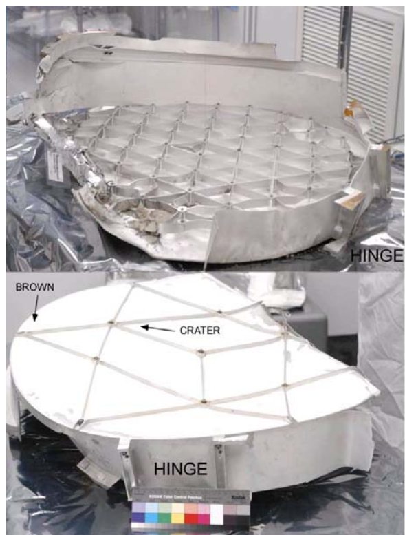
Fig. 3. Interior (upper) and exterior (lower) views of the science canister cover, as received at JSC. Arrows point to the location of the micrometeorite crater (fig. 4) and brown discoloration (fig. 5).

Micrometeorite impact: One crater, with morphology of typical micrometeorite impact craters, was observed. The crater, approximately 400 \mu\text{m} in diameter, is surrounded by a dark halo (fig. 4). The