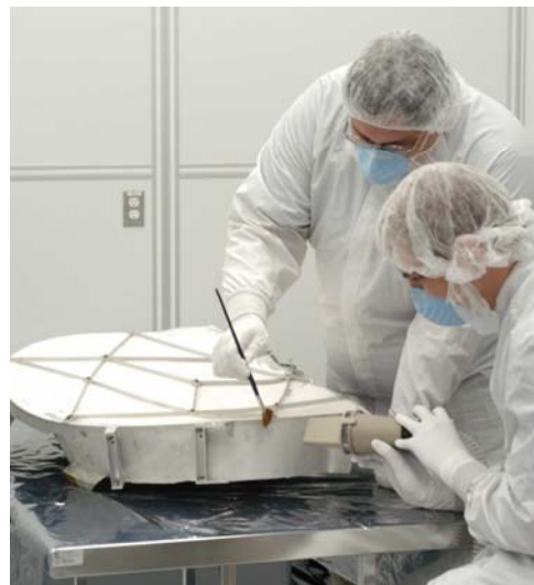
Fig. 6. Cleaning of the canister cover by gentle brushing into vacuum filter.

Cleaning and storage. The canister was cleaned for storage so that loose dust would not further react with the hardware surfaces and to prevent cross-contamination during storage. Gentle cleaning of the surface was done by using a fine-haired brush to sweep loose particles into a filtered vacuum cleaner, as shown in fig. 6. The vacuumed debris was collected on a filter and saved for analysis. However, the white painted surface was not cleaned. Finally, both items were enclosed in a black bag to inhibit UV degradation and placed in permanent storage.