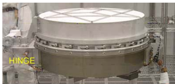
Fig. 1. Pre-flight configuration of the science canister.

Introduction: The Genesis science canister is an aluminum cylinder (75 cm diameter and 35 cm tall) hinged at the mid-line for opening (fig. 1). This canister was cleaned and assembled in an ISO level 4 (Class 10) cleanroom at Johnson Space Center (JSC) prior to launch. The clean solar collectors were installed and the canister closed in the cleanroom to preserve collector cleanliness. The canister remained closed until opened on station at Earth-Sun L1 for solar wind collection. At the conclusion of collection, the canister was again closed to preserve collector cleanliness during Earth return and re-entry. Upon impacting the dry Utah lakebed at 300 kph the science canister integrity was breached [1]. The canister was returned to JSC. The canister shell was briefly examined, imaged, gently cleaned of dust and packaged for storage in anticipation of future detailed examination. The condition of the science canister shell noted during this brief examination is presented here. The canister interior components were packaged and stored without imaging due to time constraints.