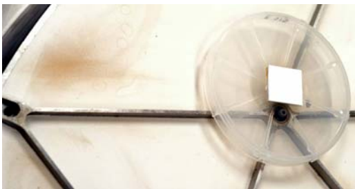
Fig. 5. Gradient of discoloration on the canister cover. The white square, sitting in a 4-inch dish, is pre-flight reference material.

Brown discoloration: Fig. 5 shows a gradient of discoloration on the canister's white painted surface. Discoloration appears around rib "shadows". Accurately mapping and analyzing the distribution of discoloration may be useful. Interior parts of the canister, which are unpainted and unanodized aluminum, also have discoloration referred to as "brown stain" which is thought to be due to UV polymerization of a hydrocarbon or siloxane contaminant [2]. However, it is unclear whether the two types of discolorations are due to related mechanisms.