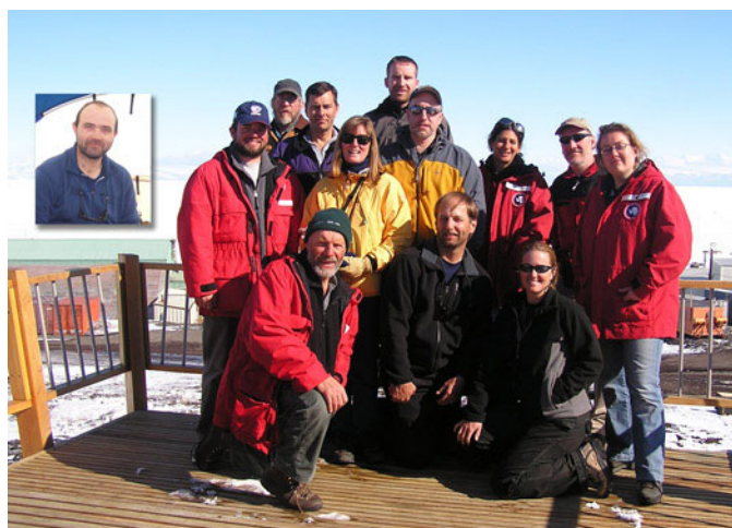
2005-2006 ANSMET field teams:

The 2005-2006 ANSMET field season went like clockwork but was a lean one for meteorites - only 171 for the systematic searching team in the Miller Range and 67 for the reconnaissance group exploring several blue ice patches south