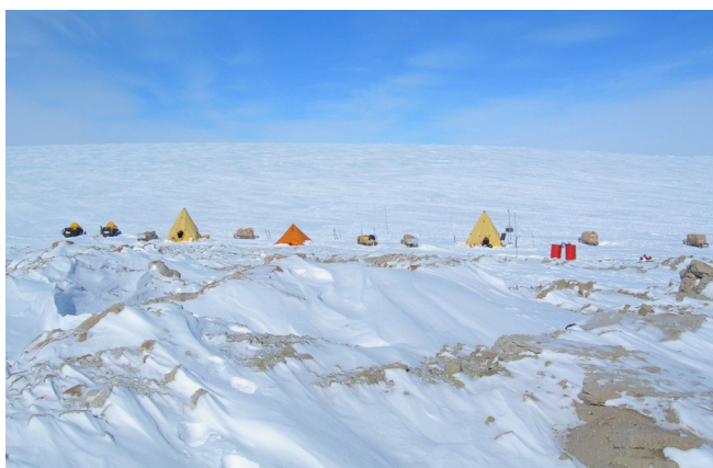
The reconnaissance team's DeWitt camp in the Taylor Valley region, their third camp of the season.

In a nutshell, it was a year marked by odd weather and low recovery numbers. While it certainly wasn't our plan to recover only a fifth of the typical haul of recent years, we worked hard and dealt with the conditions as best we could. I'm sure there are a few rocks in the 05 collection that will interest you. Certainly we're happy to let the curators at JSC and the Smithsonian catch their breath just a bit after several seasons of 1200+ recoveries.