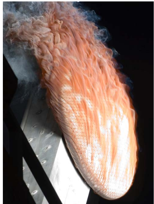
Figure 6 - Solar tower testing of 1-meter SRAM-20 aeroshell

The SRAM-20 TPS over ATK-produced structure was baselined in the ST9 Aerocapture proposal to the New Millennium Program (NMP). The detailed plan, cost, and schedule for maturing this aeroshell system to flight readiness was deemed appropriate and well-defined by the ST9 proposal review teams. Although Aerocapture was not chosen as the technology to be matured by ST9, there are plans within ISPT to implement as much of the ground development proposed for ST9 as possible. This includes manufacturing a 2.65-meter aeroshell with SRAM-20 ablator, to be instrumented and non-destructively evaluated by 2010.