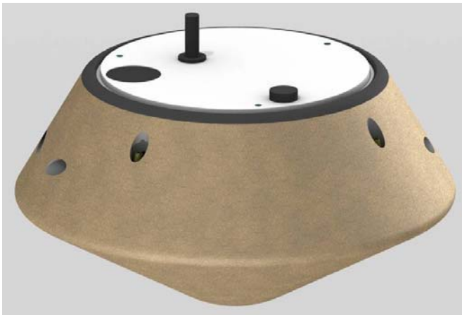
Figure 7 - Proposed ST9 aerocapture vehicle