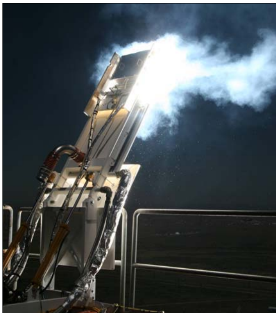
Figure 4 - Solar tower testing of flat structure/ablator panel

The culmination of the Langley, ATK, and ARA effort is the manufacture of 1-meter diameter, 70° sphere-cone aeroshells, two of which were thermo-structurally tested at the Solar Tower in October 2007 (see Figs. 5 & 6). The aeroshell tests validated manufacturing processes for a doubly-curved shape; one was an aluminum-core structure with SRAM-20 TPS, and the other was a titanium-core structure with PhenCarb-20 TPS. Data reduction is still underway, but early analysis shows that the bondline temperatures on the titanium article reached an average of 325° C, with some up to nearly 400°C. Neither of the articles exhibited any debonding, warping, or other failures as a result of the tests. Successfully accomplishing these unique, rigorous tests on large articles represents a significant jump in the technology readiness level of these systems, making them proposal-ready.