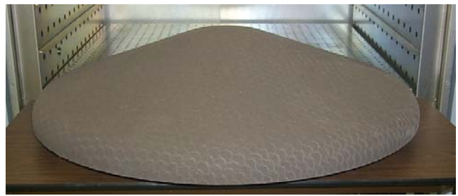
Figure 5 - One meter aeroshell ready for solar tower test

The SRAM-20 TPS over ATK-produced structure was baselined in the ST9 Aerocapture proposal to the New Millennium Program (NMP). The detailed plan, cost, and schedule for maturing this aeroshell system to flight readiness was deemed appropriate and well-defined by the ST9 proposal review teams. Although Aerocapture was not chosen as the technology to be matured by ST9, there are plans within ISPT to implement as much of the ground development proposed for ST9 as possible. This includes manufacturing a 2.65-meter aeroshell with SRAM-20 ablator, to be instrumented and non-destructively evaluated by 2010.