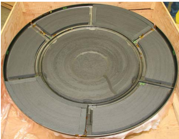
Figure 3 – Lockheed Martin 2-meter carbon-carbon aeroshell (inside view)

The second significant advancement from Lockheed is a “hot structure” aeroshell system. It is different from the traditional Mars system in that the TPS is not bonded to the front of the aeroshell; a composite structure takes the mechanical loads and heat of entry, and insulation inside the aeroshell protects the payload. The composite aeroshell, built by Carbon-Carbon Advanced Technologies (C-CAT), has co-cured ribs and stringers for stiffness (see Fig. 3). C-CAT manufactured a 2-meter diameter, 70° sphere-cone aeroshell, which was tested in a pressure bag load-test fixture to the qualification levels of a Titan aerocapture.