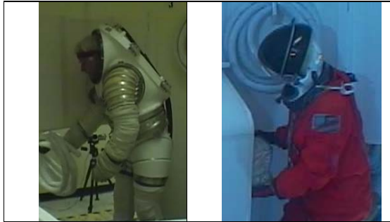
Figure 1. Left: Subject wearing Mark III suit uses rear hatch of vehicle; Right: Subject wearing ACES accesses stowage

person wearing a non-functional simulated Mark III suit stood at one control station in order for the subjects wearing the actual suits to judge access to controls.