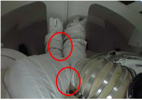
Figure 2. Mark III subject collides with simulated Mark III suit while attempting to access vehicle controls

Further analysis considered a hypothetical case of multiple large males occupying the volume of the vehicle. Mathematical analysis enabled predictions concerning the fit of males with maximal critical dimension values (see Figure 3).