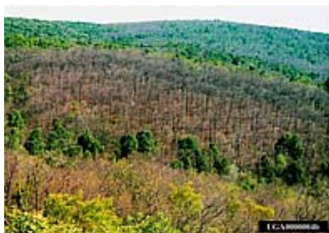
Denuded, Partially Denuded, Chlorotic, and Green Forest Vegetation