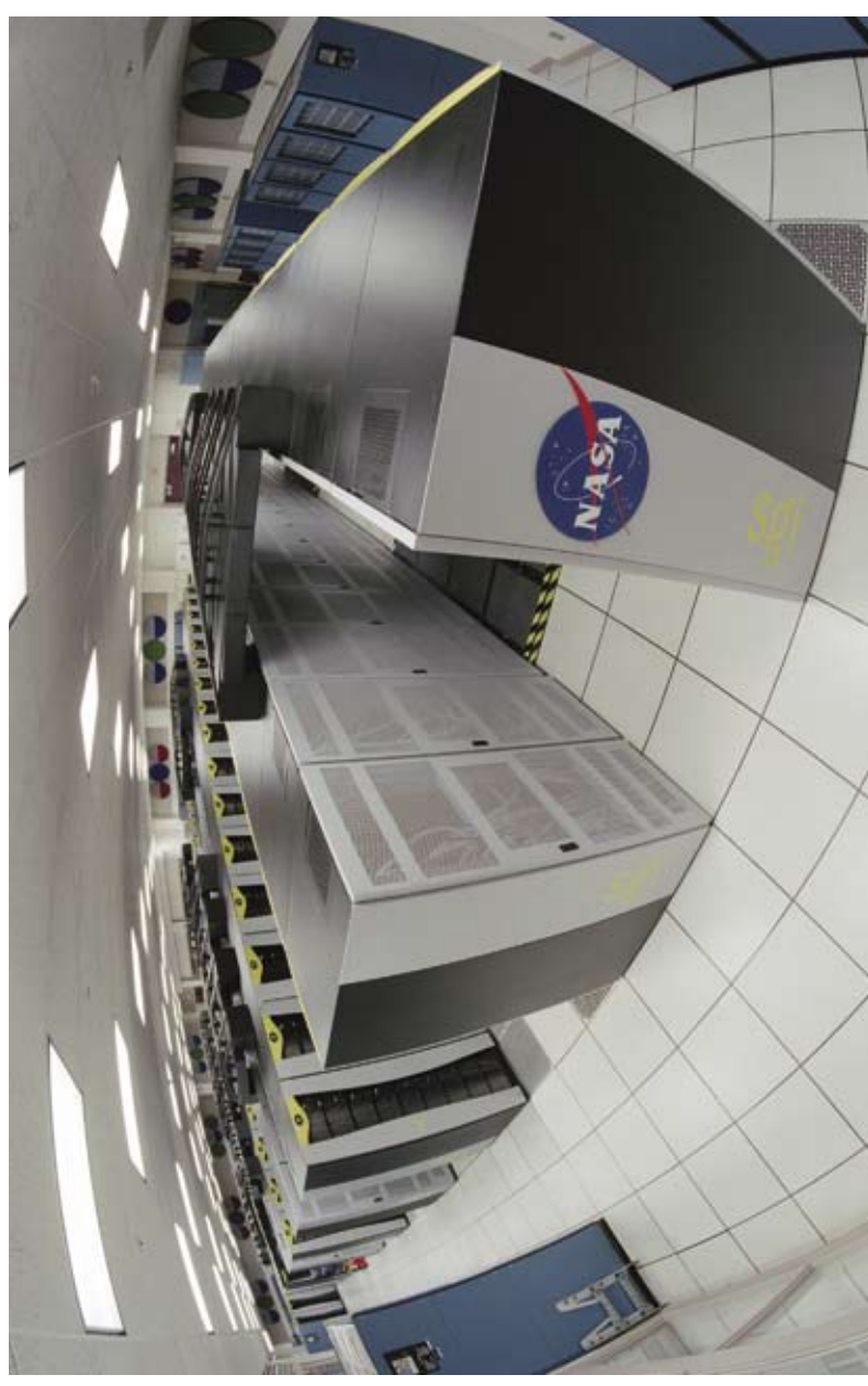
A bird's-eye view of the 10,240-processor SGI Altix "Columbia" supercomputer located at Ames Research Center. While Columbia is helping NASA achieve breakthroughs and solve complex problems in support of its missions, it has also been made available to a broader national science and engineering community.