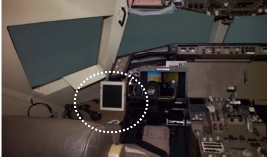
Figure 1. Integration Flight Deck