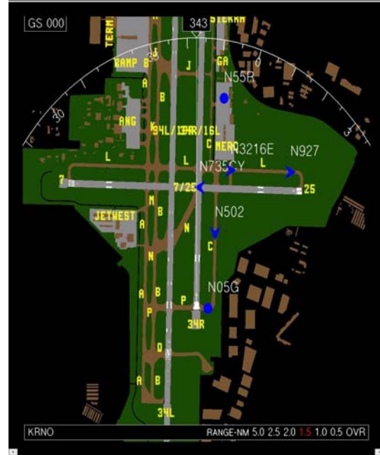
Figure 3. Plan-View Surface Map with Traffic (BMOT)

When traffic data was provided, it was “broadcast” at a 1 Hz rate. Own-ship position data was updated at a 20 Hz rate. Positional errors, noise, or uncertainties were not introduced into these data.