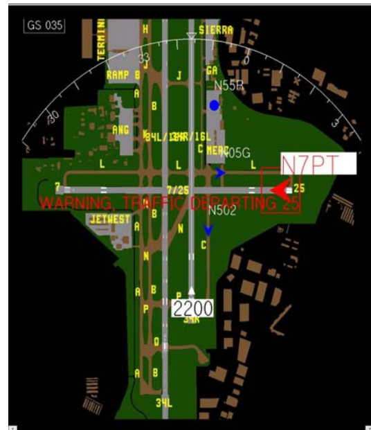
Figure 4. Plan-View Surface Map with Traffic and Alerting (BAMOT)