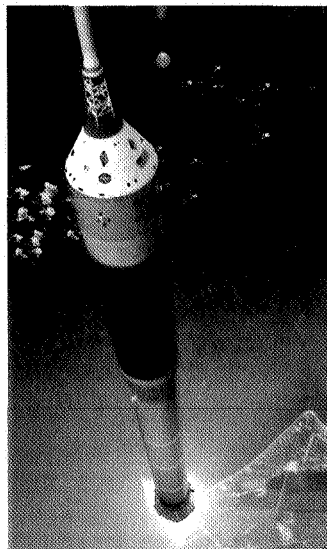
Figure 1. The CLV will loft the CEV early next decade (artist's concept).

NASA rolled out its exploration architecture solutions in fall 2005 and established the CLV Project as part of the Constellation Program to design, develop, test, and operate the transportation system for the Crew Exploration Vehicle (CEV) (see Figure 1). The CLV configuration was selected based on figures of merit that included greatly improved safety and reliability, coupled with dramatic decreases in operations costs. A fixed budget and accelerated schedule also were factors against which both Shuttle-derived and expendable launch vehicle options were measured.