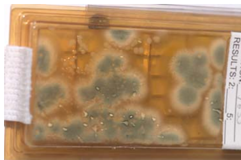
Figure 5. Example of a microbial sample. This sample was grown as part of routine environmental monitoring on ISS.

Environmental monitoring research has been performed on all ISS Expeditions and will continue to be performed on future station missions to ensure the health of the spacecraft as well as of the crew. During one study of the ISS atmosphere 12 bacterial strains were isolated from the ISS water system. These bacteria consisted of common strains and were encountered at levels below 10,000 colony-forming units/10 cm 2 , well below the minimum of bacteria needed to cause illness. These data document the environment on