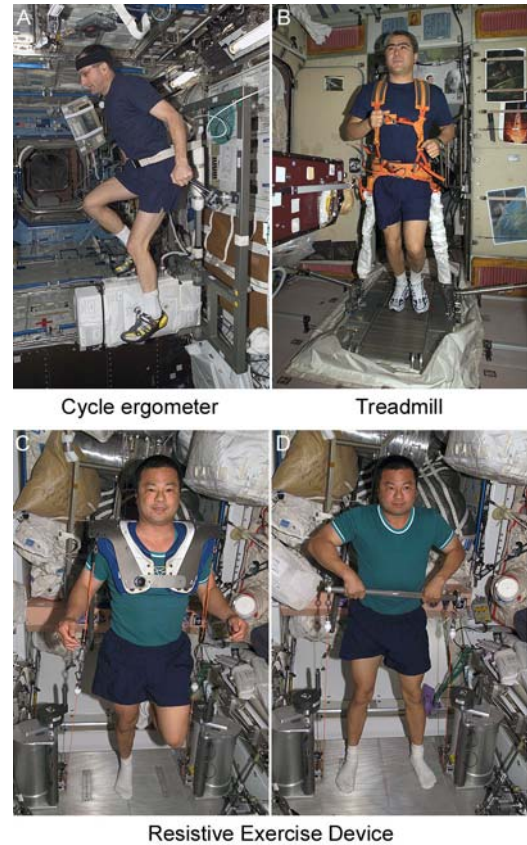
Figure 3. Exercise modalities on ISS. A. Astronaut Donald R. Pettit uses the Cycle Ergometer with Vibration Isolation System (CEVIS) in the Destiny laboratory, ISS006-E-13965, 2 January 2003. B. Cosmonaut Salizhan S. Sharipov, equipped with a bungee harness, exercises on the Treadmill Vibration Isolation System (TVIS) in the Zvezda Service Module, ISS010-E-05609, 31 October 2004. C. Astronaut Leroy Chiao, wearing squat harness pads, exercises using the Resistive Exercise Device (RED) equipment in the Unity node, ISS010-E-05325, 28 October 2004. D. Chiao uses the short bar on the SchRED to perform upper body strengthening pull-ups, ISS010-E-05343, 28 October 2004.

Preliminary results have already given us great insight into why bone is being lost by crewmembers during their stay on ISS in spite of the exercise protocols in place. Peak forces experienced during treadmill runs were