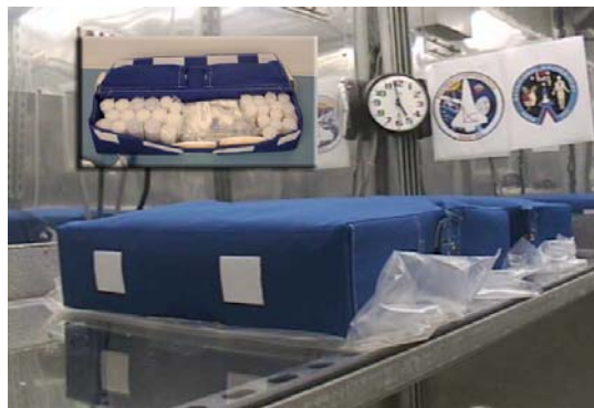
Figure 2. Stability kits inside the Orbital Environmental Simulator at the Kennedy Space Center. Inset shows packages of pills and foods inside the kit.