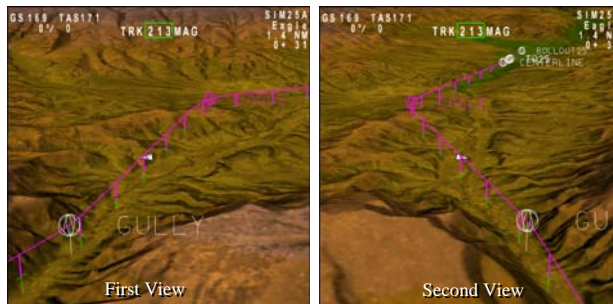
Figure 3. Static Screenshots of “Perspective” Mode Sequence