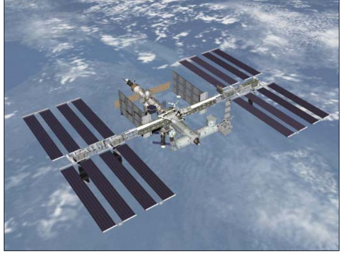
Figure 1: The ISS at assembly complete.

The evolution of vehicles to transport crew and cargo to the ISS is representative of the evolution of the ISS. Since its original concept and design, partners and elements have been added, and elements have been