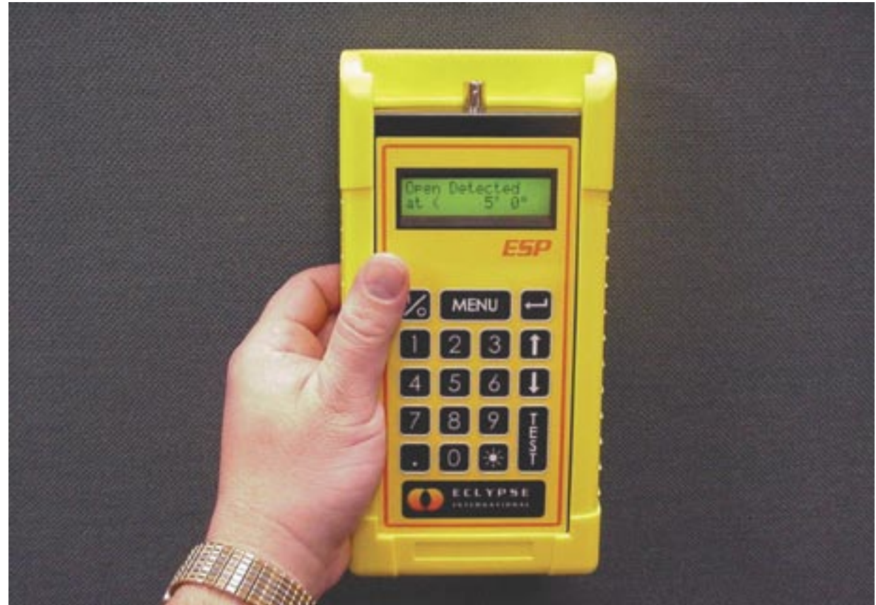
The Eclypse hand-held, non-intrusive analyzer finds the precise location of a short or open circuit in a cable.

Although the ESP tag for Eclypse's commercial hand-held tester does not stand for "extrasensory perception," the product comes pretty close to having a "sixth sense" in the way that it detects electrical malfunctions with speed and precision. The company claims that the ESP is