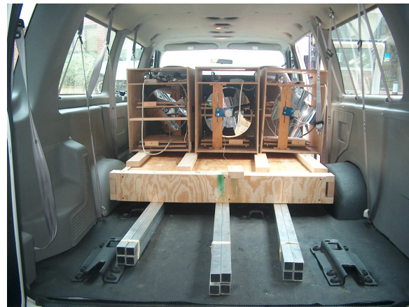
Figure 4: Mirrors (boxed), frame members, and alignment boxes in van.

The combination of this approach to stereoscopic projection, use of commodity personal computers for rendering, and ancillary optimizations, enabled us to construct a portable version of the CAVE for under $30,000. The system weighs less than 500 lbs and fits into the back of a fifteen-passenger van (Figure 4) with one remaining row of seats. See Table 1 for weights and costs of each major system component.