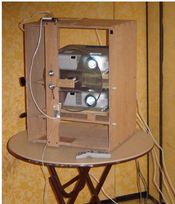
Figure 1: Early alignment box with aluminum chopper wheel.

We aligned the projector's images using a locally developed wood alignment box with numerous adjustments; the chopper wheel was an aluminum disc twelve inches in diameter and 1/8" thick, with two ninety-degree openings. A small DC motor attached to the face of the alignment box drove the optical chopper. We selected inexpensive liquid-crystal display projectors with XGA resolution; SXGA-resolution projectors would improve our overall visual quality but raise our projector costs roughly threefold.