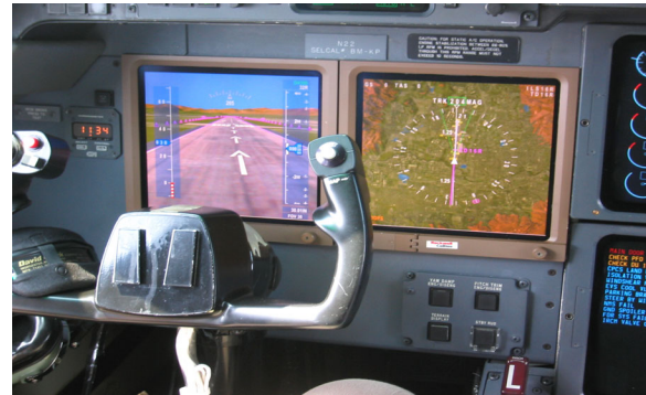
Figure 1. GulfStream-V SVS Head-Down Displays

Meteorological Conditions (IMC) when needed experimentally. The VRD was removed no lower than 200 ft. above field elevation.