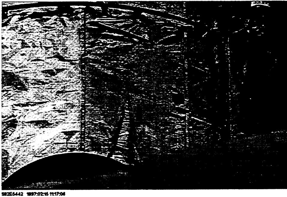
FIGURE 2: SM2 LS SPECIMEN ON-ORBIT The top-center of this image shows the roughly triangular SM2 LS specimen on the Light Shield at SM2 prior to retrieval. A handrail and standoffs are apparent across the top of the image. The specimen is curled very tightly, so that it is detectable here as a triangular region where the next layer of the MLI is visible. The raised feature at the bottom edge of the triangular opening contains the entire specimen that covered this triangle prior to the damage. At the bottom of the image, the tip of the largest crack on HST is seen propagating vertically towards the top of the telescope. This large crack also opened to reveal the next MLI layer.