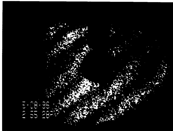
Figure 2. Shown above is a view through the preliminary cell filled with \text{SF}_6 near the critical point. The dark circle in the middle is the 1/4 inch diameter spherical electrode. The dark stripes are interference fringes made using holographic interferometry. These fringes are reference fringes made by tilting an object beam mirror between holographic exposures. We have observed a fringe shift of \sim 1/2 of a wavelength on applying 3000 volts (RMS) to the cell when the fluid is \approx 20\text{mK} above the critical point (supercritical fluid).

the cell design and maintains geophysical similarity. The density variations will be observed by using holographic interferometry where laser light is passed through the cell to produce an interference pattern