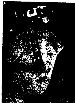
System in the stowed position.