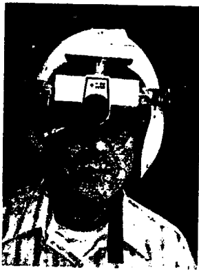
Front view of the system.

stabilizes the optical head and helps to keep the system in calibration during use. The helmet-mounted eye movement measuring system, figure 2, weighs 1,530 grams; the weight of the present aviators' helmet in standard form with the visor is 1,545 grams.