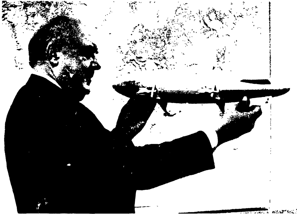
MODEL OF HELI-STAT BASED ON SHORTENED MACON ENVELOPE FIGURE 5

The resulting vehicles will provide a unique service of heavy vertical lift and positioning far exceeding the capabilities of any other means available today, and extend man's orderly development of his environment.