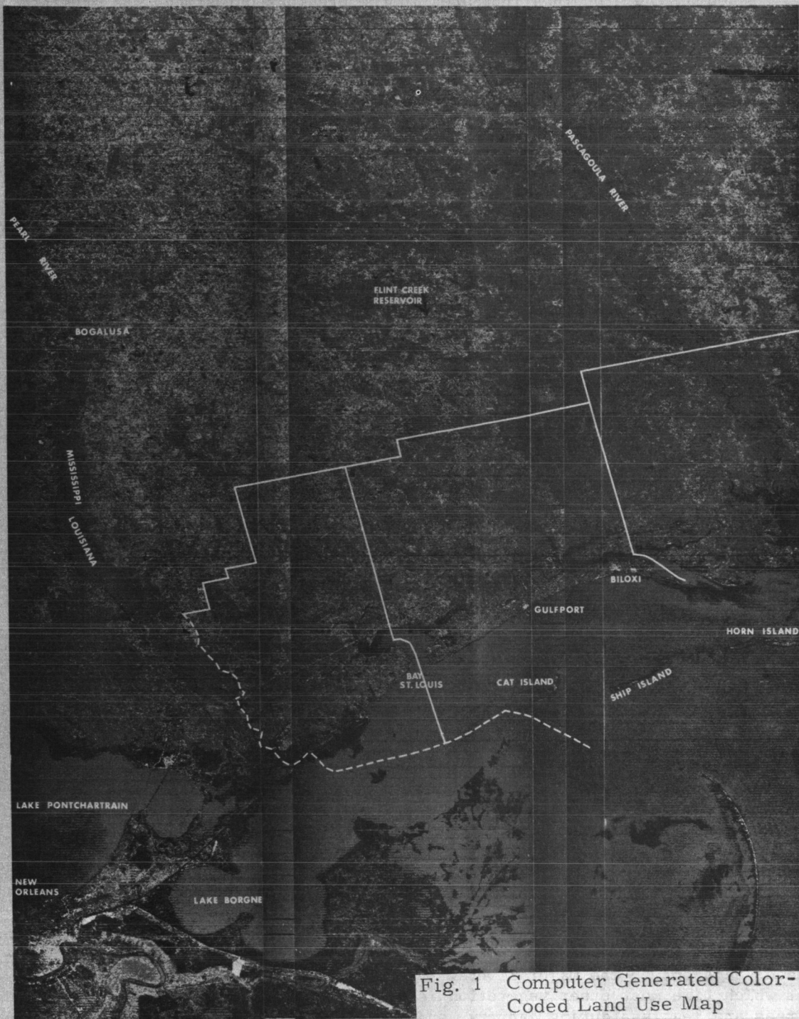
Fig. 1 Computer Generated Color-Coded Land Use Map