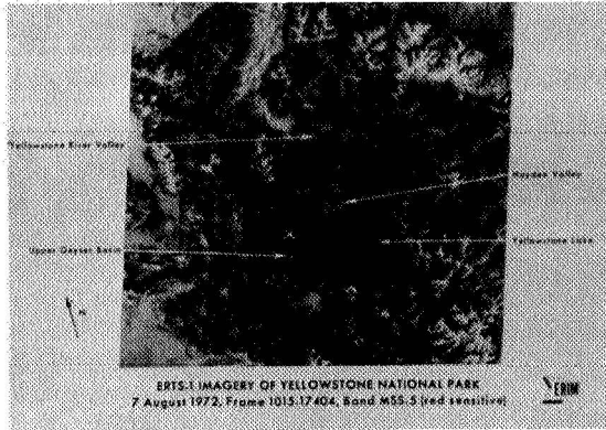
Figure 1 Yellowstone National Park Imagery