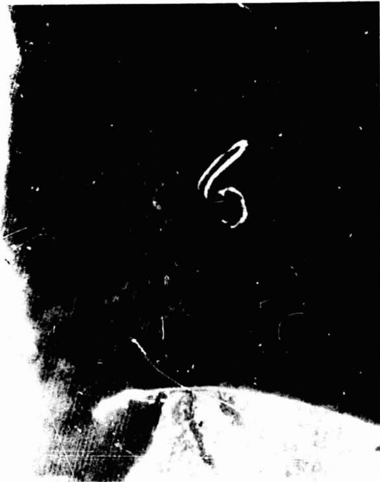
FIGURE 2 ERIS-1 IMAGE MSS 5 0.6-0.7 \mu m E 1024-15071