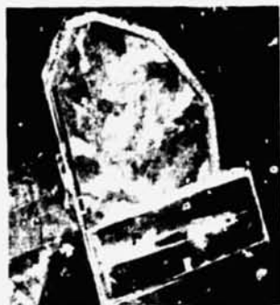
Mine dump 1/L/38,39