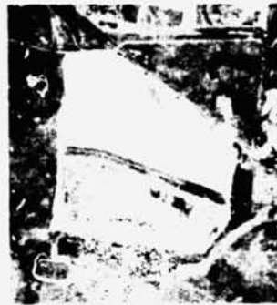
Mine dump 3/L/5,6