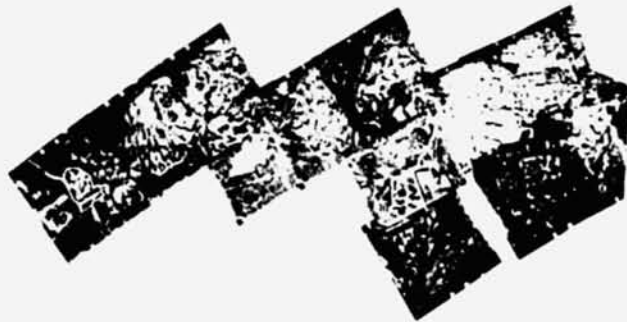
FIG. 2 : Aerial photography mosaic of West Witwatersrand area