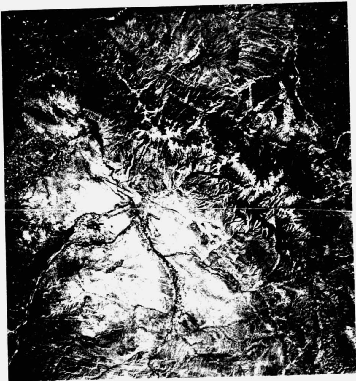
Fig. 1 - Positive print, MSS-7