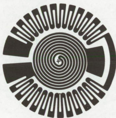
Strain Gage Pattern