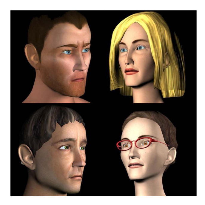
Fig. 1. The four SAL character avatars. Clockwise from top-left: Spike, Poppy, Prudence, and Obadiah.

In the first experiment, 11 Semi-automatic SAL recordings provided 44 character sessions with a procedure directly comparable to Solid SAL. Experiments 2 and 3 used degraded versions of Semi-automatic SAL in which two of the four character sessions were with the full Semi-automatic SAL system while the other two were degraded. A further 25 sessions took place (13 in Experiment 2 and 12 in Experiment 3) with differing degrees of degradation of information to the operator. The operator videos consist only of the operator interacting with the interface and show little of interest regarding the conversational interaction;