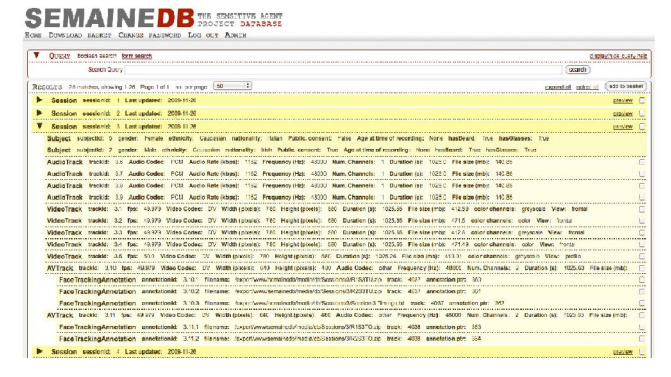
Fig. 5. Data organization of the database.

challenges similar to the Interspeech audio-analysis series (e.g., [44]) and the FERA facial expression recognition challenge [45]. The database also defines a partitioning of the publicly available data into a training, development, and test set. The training set would be used by researchers to train their systems with all relevant parameters set to a specific value, while the development set would then be used to evaluate the performance of the system given these parameters. The partitioning information is specified in two text files available from the website.