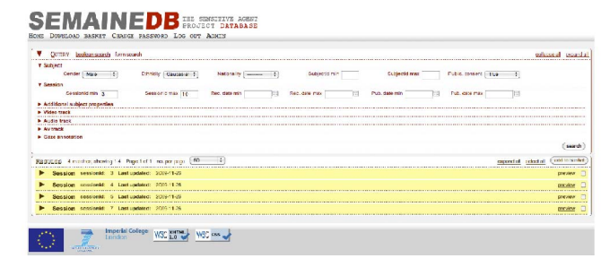
Fig. 6. Form search: some options and the search results.

Beyond that, it is natural to add new types of labeling to the recordings. That has various levels. The kind of tracing that has been applied to Solid SAL should be extended to Automatic and Semi-automatic SAL recordings. More radically, fuller annotation of gestures in the recordings would open the way to a range of analyses. Multiple types of gesture are present—facial movements, head nods and shakes, and laughs. The quality of the material means that identification could be automated to a large extent, providing what would be by contemporary standards a