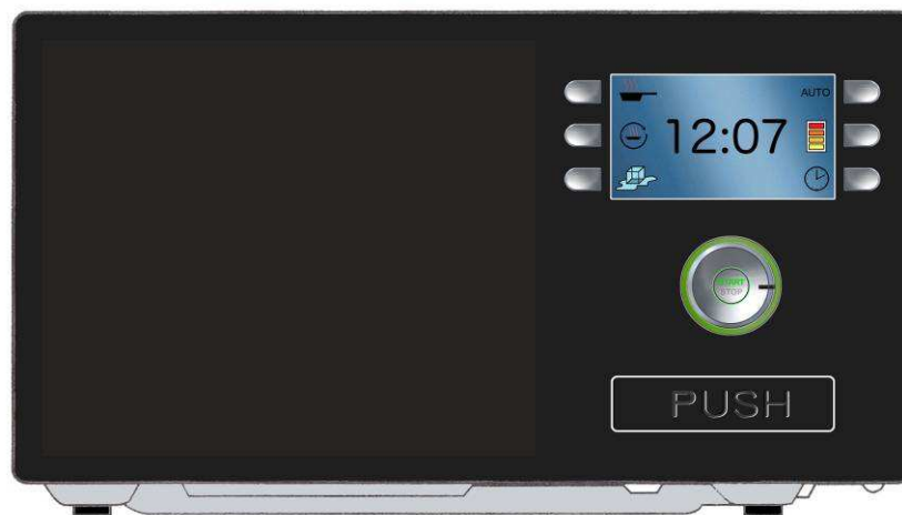
Figure 2. New microwave design

The design is discussed in depth elsewhere (Blackler et al., 2007a), but here it is important to note that the new design produced using the refined tool applied features familiar from other products to the microwave, for example the menu interface (Figure 3) was similar to an ATM as the great majority of microwaves users the students interviewed were familiar with ATMs.