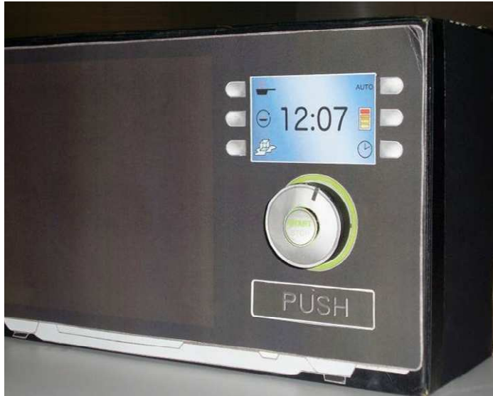
Figure 7. Cardboard model of new microwave