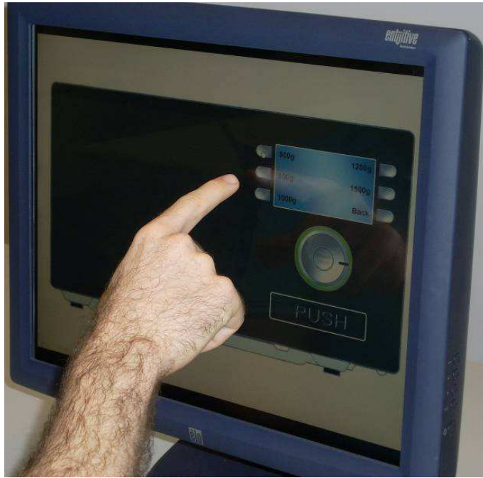
Figure 4. New microwave prototype in use