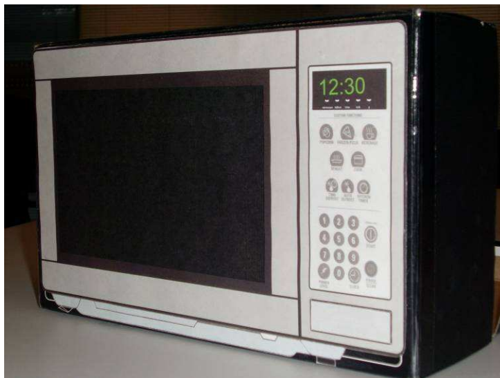
Figure 6. Cardboard model of old microwave