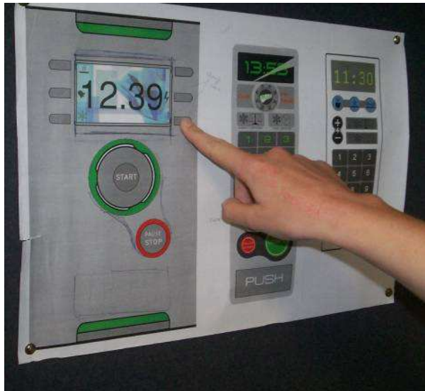
Figure 8. Paper prototype testing of alternatives for the microwave interface

Ehn & Kyng (1991) and Rust (2004a, 2004b) discuss the potential of low-fidelity prototypes as participatory design tools. Bonner and van Schaik (2004) used paper prototypes and asked participants to assess them incrementally during the design process. They claim that this allowed for a higher degree of impartiality on the part of the designers as the decisions were based on users' feedback. However, participants hinted that they were sometimes making uninformed, arbitrary decisions. This suggests that this approach needs to be used carefully.