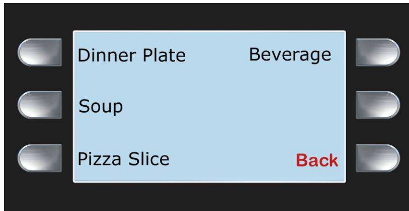
Figure 3: Example sub-menu

The students' observations using low fidelity paper prototypes suggested that the new design was more intuitive to use than the original, and they felt that using our tool was a major factor in the increased usability of the product. However, to collect the very precise measures needed to establish intuitive usability, one of which is time (Blackler, Popovic, & Mahar, 2004b), higher-fidelity prototypes were required (Bonner & Van Schaik, 2004; Hall, 1999; Rudd et al., 1996; Sauer et al., 2008).