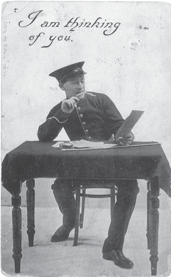
Fig. 1. Postcard from S. E. Brown to mother, date illegible, papers of S. E. Brown, Department of Documents, Imperial War Museum, 89/7/1, copyright Michael Brown.

you'. A studio image, to the modern eye it seems stilted and the words even slightly comic. The soldier wears a braided uniform and he sits at a desk with an ostentatious quill pen; soldiers on active service were more likely to write home in pencil with notepaper balanced on their knees. This postcard is one of many depicting soldiers writing home. They evoke the apparent power of nostalgia to bring loved ones separated by war together (see Figures 2–4).