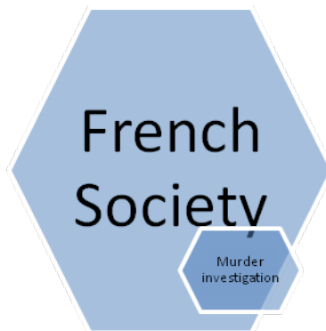
Figure 1 Graphic representation of the place of murder investigation in French Society

In England by contrast, the criminal is seen as someone outside of society, with little in common with it, and this attitude to criminality affects all those who deal with it – including murder investigators.