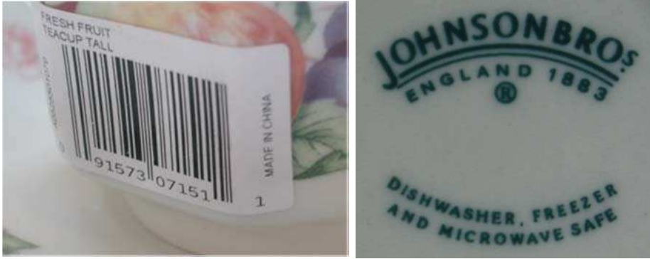
Fig.5. Backstamp. Fig.6. Detachable label, indicating 'Made in China'.

A third more unusual trend is for Staffordshire brands, such as Churchill China, to declare in the indelible backstamp that the product was 'Made in China'. A fourth trend has been a shift from stating 'Made in England' to 'Designed in England' to reinforce UK links, without any indication of place of manufacture on detachable labels, or packaging. A fifth approach is to declare 'Decorated in England' which is a reflection of UK firms using imported white-ware, normally from the Far East. Finally, the sixth trend can be a more ambiguous approach whereby one Staffordshire company called, 'Rose of England China', stated on their packaging that mugs were 'Made in England', whilst the mugs themselves are individually marked 'Rose of England, Made in China' (Figure 7-8).