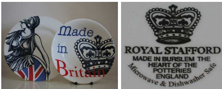
Fig.11. Royal Stafford Tableware, 'Britannia' Fig.12. Backstamp. range, tableware, earthenware, c2009.

In reality, maintaining production in Stoke-on-Trent stemmed from Bridgewater's desire to create jobs in the UK. Similarly, a Staffordshire firm called Royal Stafford Tableware has created backstamps that emphasize the Potteries and even surface pattern designs incorporating the phrase 'Made in Britain'. This is another example of a type of marketing strategy that has emerged reflecting the impact of globalization (Figure 11-12). However, the Managing Director of Royal Stafford, when interviewed, established that the motivation for continuing production in the UK stemmed from maintaining design and manufacturing agility issues, rather than a perceived consumer demand (Interview 4).