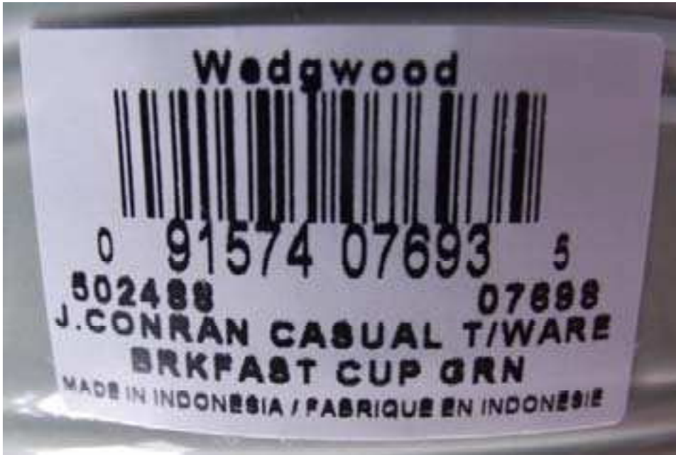
Fig.3. Detachable label, 'Made in Indonesia'.

The next outsourcing example exists where the Staffordshire brand name and 'England' are provided within the indelible backstamp, but the detachable label, or the packaging indicates a Far Eastern place of manufacture. In the manner of Lash and Urry's view, the marketing (or backstamp) creates links with the UK. The word 'England' has in these circumstances come to signify the origin of the brand, rather than place of production. A Johnson Brothers' cup and saucer demonstrates this trend. The printed backstamp reads 'Johnson Bros England 1883' (the year the firm was founded), but the detachable label indicates that it was actually manufactured in China (Figure.4-6).