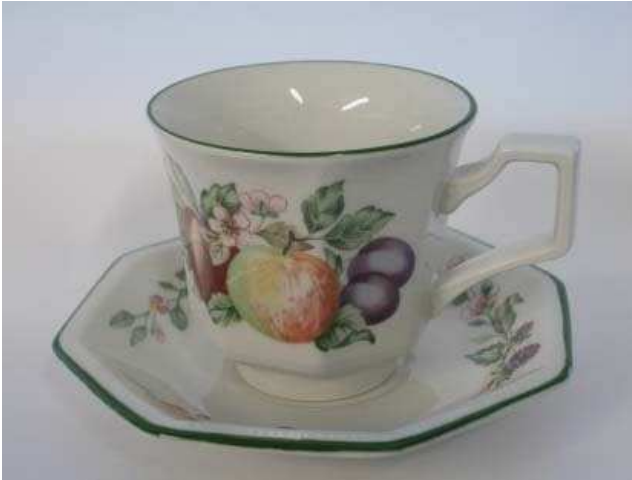
Fig.4. Johnson Bros 'Fresh Fruit', cup and saucer porcelain, purchased 2008.

The next outsourcing example exists where the Staffordshire brand name and 'England' are provided within the indelible backstamp, but the detachable label, or the packaging indicates a Far Eastern place of manufacture. In the manner of Lash and Urry's view, the marketing (or backstamp) creates links with the UK. The word 'England' has in these circumstances come to signify the origin of the brand, rather than place of production. A Johnson Brothers' cup and saucer demonstrates this trend. The printed backstamp reads 'Johnson Bros England 1883' (the year the firm was founded), but the detachable label indicates that it was actually manufactured in China (Figure.4-6).