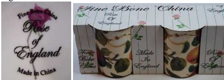
Fig.7. Rose of England China, Set of three mugs, Fig.8. Backstamp on actual mugs bone china, purchased in 2008. Packaging declaring declaring ‘Made in China’. ‘Made in England’.