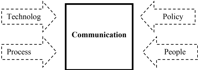
Figure 3: Forces influencing communication

According to a study completed by Succar (2009), ‘technology’, ‘process’ and ‘policy’ are the three main fields of BIM implementation. However, results from both pilot study and focus groups indicate that in any communication that occurs around BIM models ‘people’ and their behaviour and attitude towards understanding and accepting technology as well as communicating the right information is involved too. Because this study has been designed to emphasize understanding of social phenomena within construction projects and also is investigating and evaluating electronic communication patterns from a social scientist’s point of view, the researcher believes that the ‘people’ field plays a significant and vital role for this study. Hence four fields of: ‘technology’, ‘process’, ‘policy’ and ‘people’ are the main forces that influence communication in construction projects and must be considered when implementing BIM.