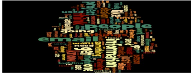
Figure 2: Word Cloud

Primary data was collected using semi-structured face to face interviews, to go deep into descriptions of events and capture implicit knowledge. In the analysis stage, all interviews were tape-recorded and transcribed accurately and accordingly. NVivo 8 and word clouds were used as the text analysis tool to look for commonly used words and to count the frequency usage of words to show the number of occurrences in each textual data.