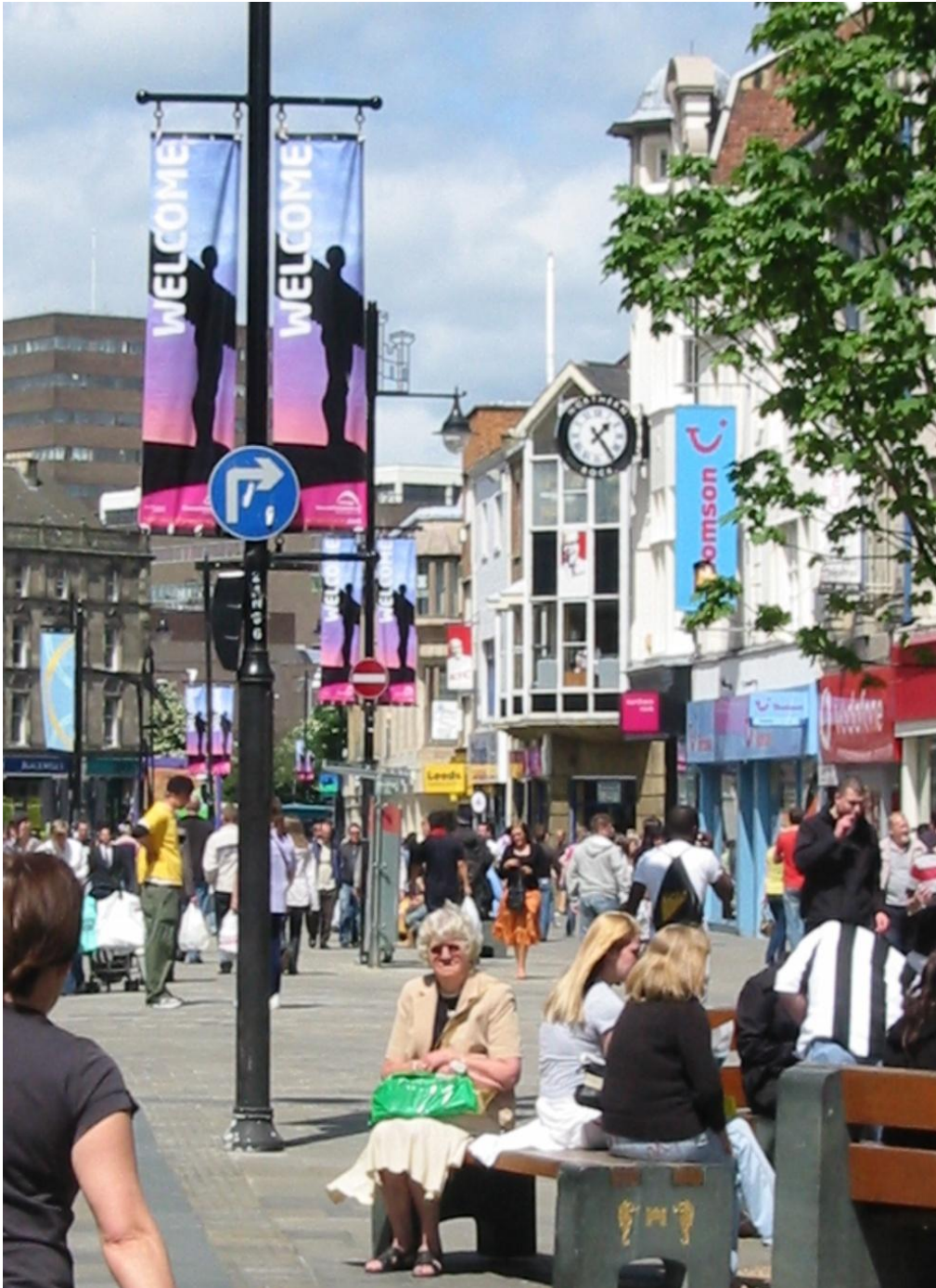
Figure 2 Northumberland St - Newcastle upon Tyne's main shopping street with welcome angel banners