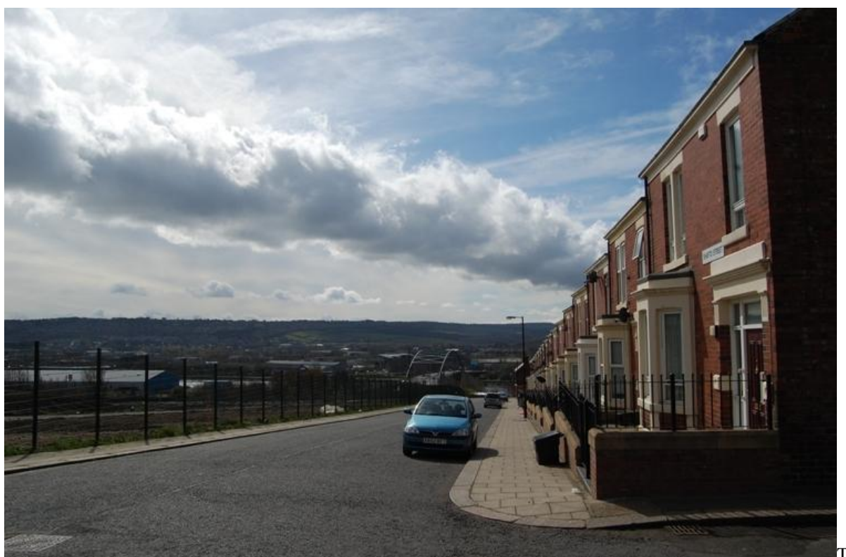
Figure 17 Shafto Street, Scotswood

A BKY spokesperson recently described the launch of the Scotswood Urban Renewal Vehicle (SURV) as ‘a major step towards the creation and regeneration of a key Newcastle community’. This begs the question of what remains of the Scotswood community and what can be expected of the future? Part of the community has been displaced never to return, some will return but to a different kind of place and culture; others are living on the periphery of development (Figure 17). Going for Growth was intended to reverse the trend of a dwindling post industrial population. Shafto Street, a terrace of handsome Tyneside houses similar to the one demolished, sits behind newly placed railings on the edge of the development and looks out across the vast building site enclosed by a two and a half metre high fence. 6 The ground is being levelled and prepared for the building programme which is expected to last for 15 years. Work has already slowed because of the discovery of mine shafts from the industrial past.