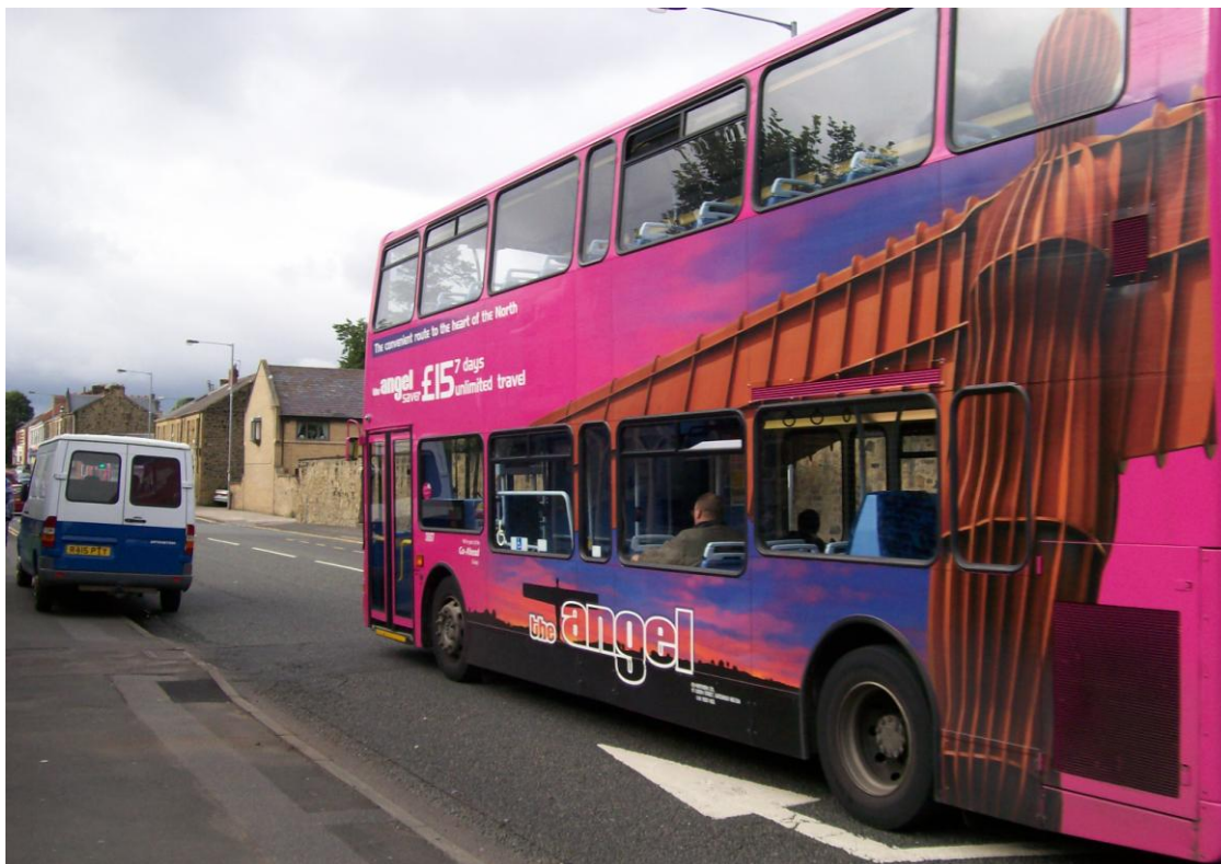
Figure 13 Gateshead bus with Angel