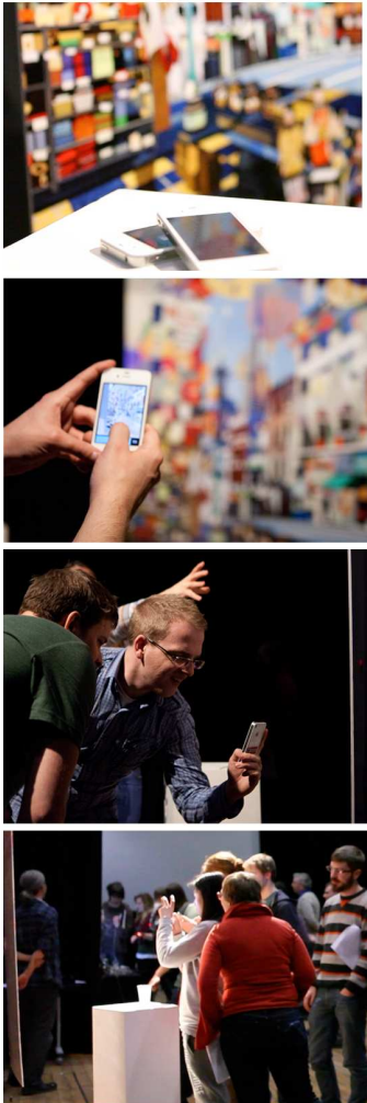
Figure 3. Exhibition shots of Repentir, using ceiling-suspended print of Transamerica.

an area, pixels from older versions of the painting are revealed under his or her finger as if they are rubbing away layers of paint. Consequently, the user is able to reveal the layers behind partial areas of the image and view pixels from multiple versions of the painting simultaneously. To achieve this partial rendering of layers, the image overlaid onto the painting is dynamically updated to display pixels from different versions of the painting, based upon which areas the user has rubbed. We envisage that future versions of the application might allow gallery visitors to create their own printable versions of the painting while using the rub technique.