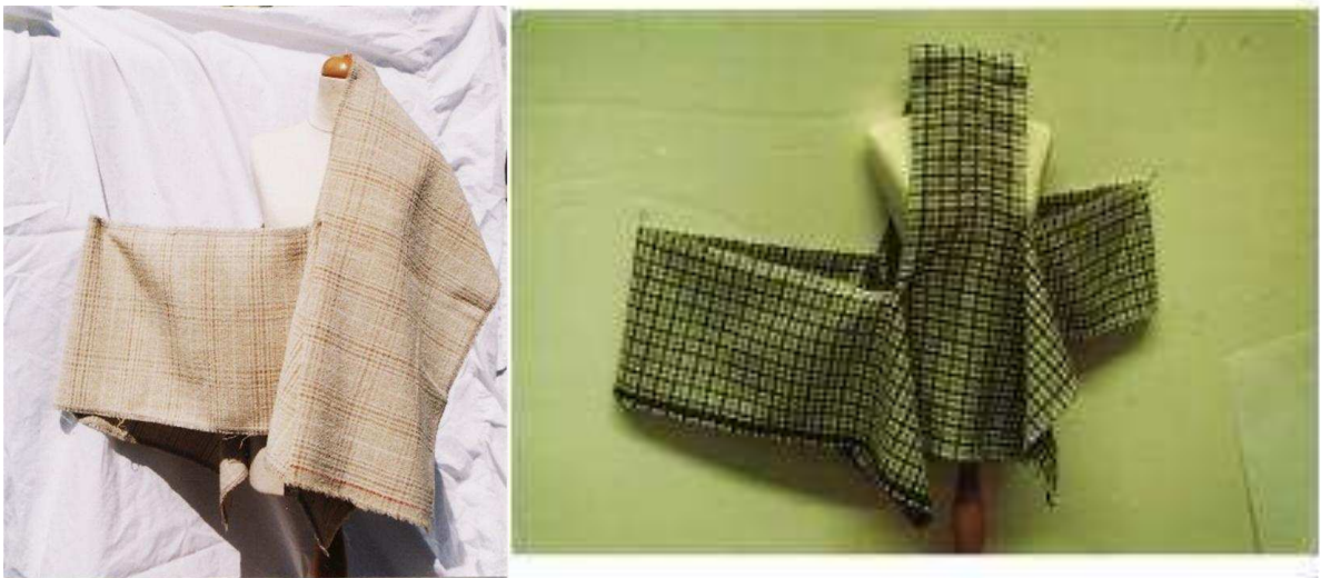
Figure 2: SCT cloths with one split (left) and two splits (right)

The Researcher then experimented with SCT in half- and full-scale and developed toiles see Figures 2-4 below as well as finished, wearable garments.