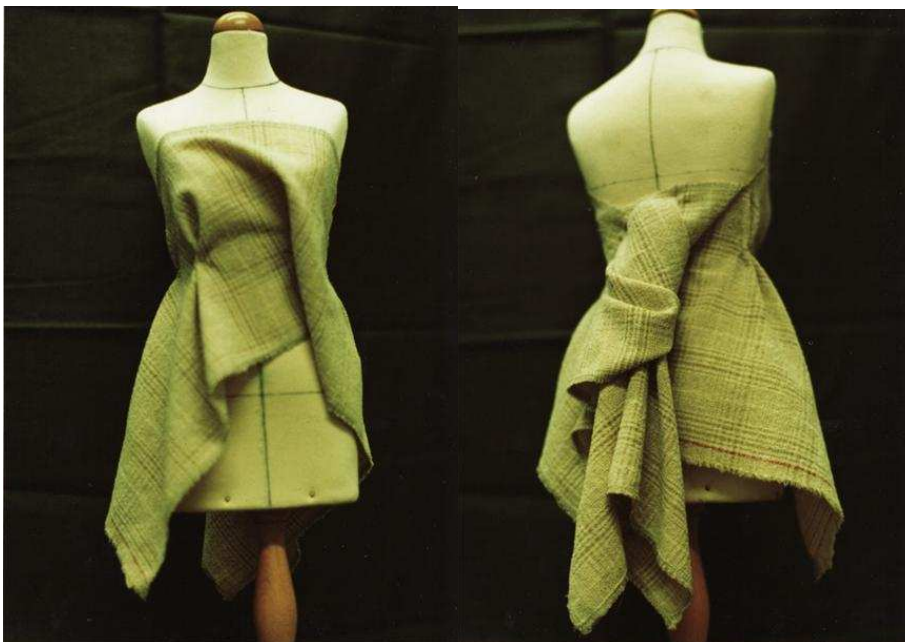
Figure 3: Sample of a SCT toile – experiment with one split