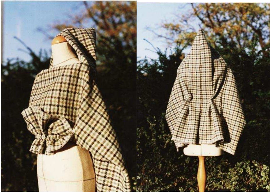
Figure 4: Sample of a SCT toile – experiment with two splits