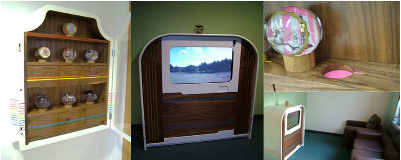
Figure 1. From left to right: The wall cabinet containing themed globes, the television cabinet with the Nature globe and Nature film playing, detail of Holiday globe with its specific color (top) and detail of the room locating the art piece (bottom).