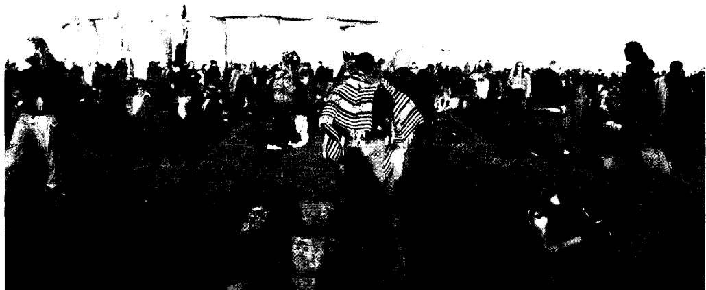
Figure 1: Summer solstice at Stonehenge (2001).

Our project draws on theory and research on 'alternative' communities and constructions of 'self' and other within late-modernity and/or postmodernity. Bauman (1997) indexes postmodernity as about 'choice': 'alternative' identities of Travellers – often 'pagan' – described by Hetherington (2000), MacKay (1998) and Martin (2002) appear a case in point. Hetherington's extended discussion of Traveller 'choices' indicates a free-flowing desire for freedom and withdrawal from the capitalist state. Martin's analysis, however,