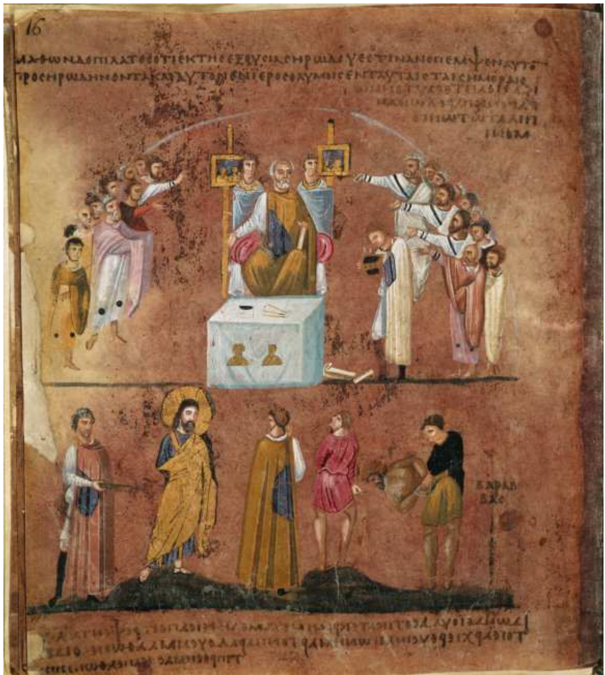
Codex Purpureus Rossanensis. Folio 8v, Christ before Pilate . Illumination, c550-575,

Diocese Museum, Rossano Cathedral, Italy