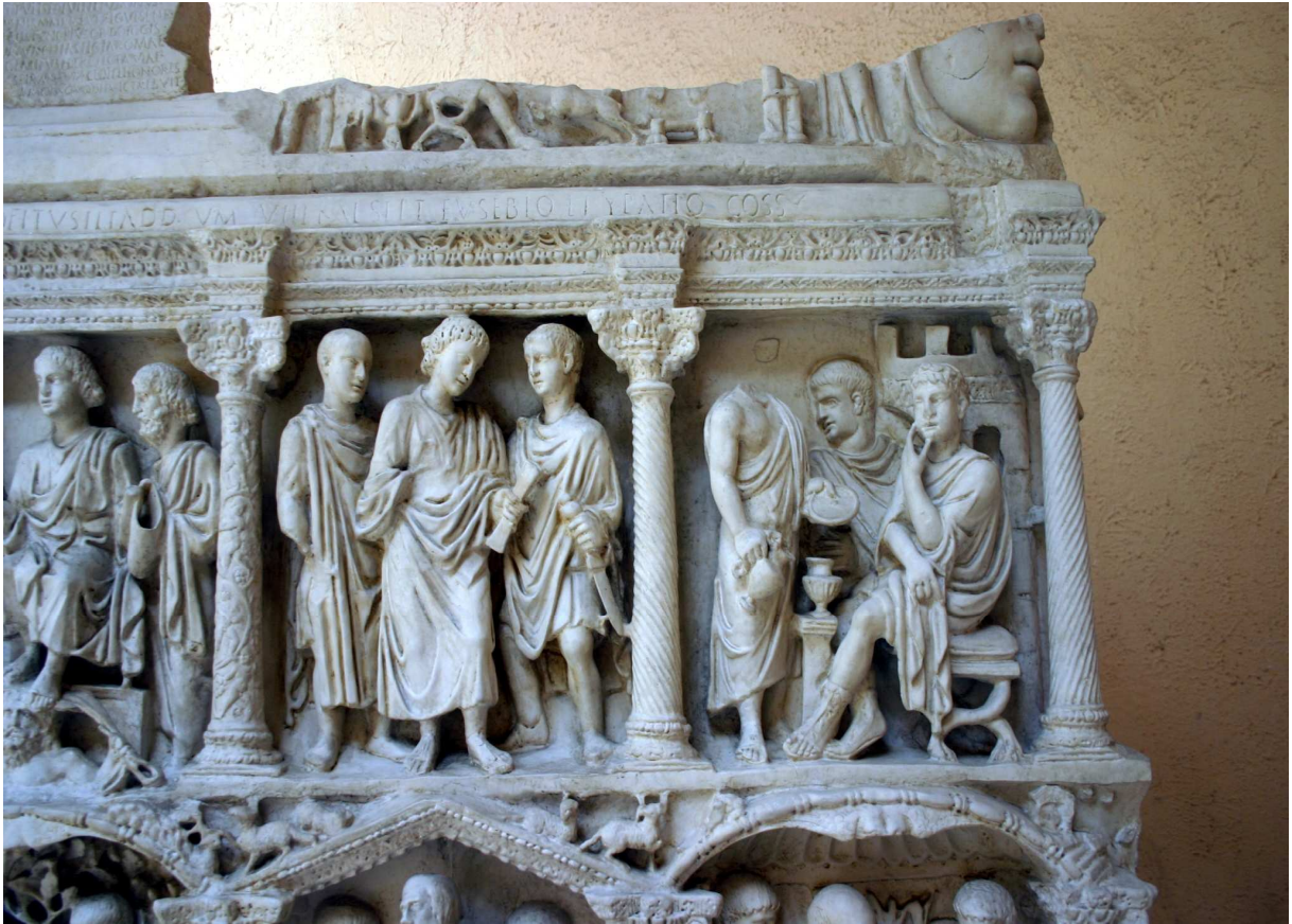
Column sarcophagus of Junius Bassus. Christ is led before Pilate (detail). marble relief, 359, Museum of S. Peter's Basilica, Vatican, Rome.