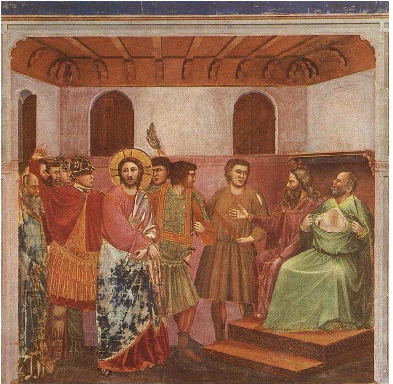
Giotto di Bondone, Christ before Caiaphas , fresco, c.1306, Scrovegni Chapel, Padua