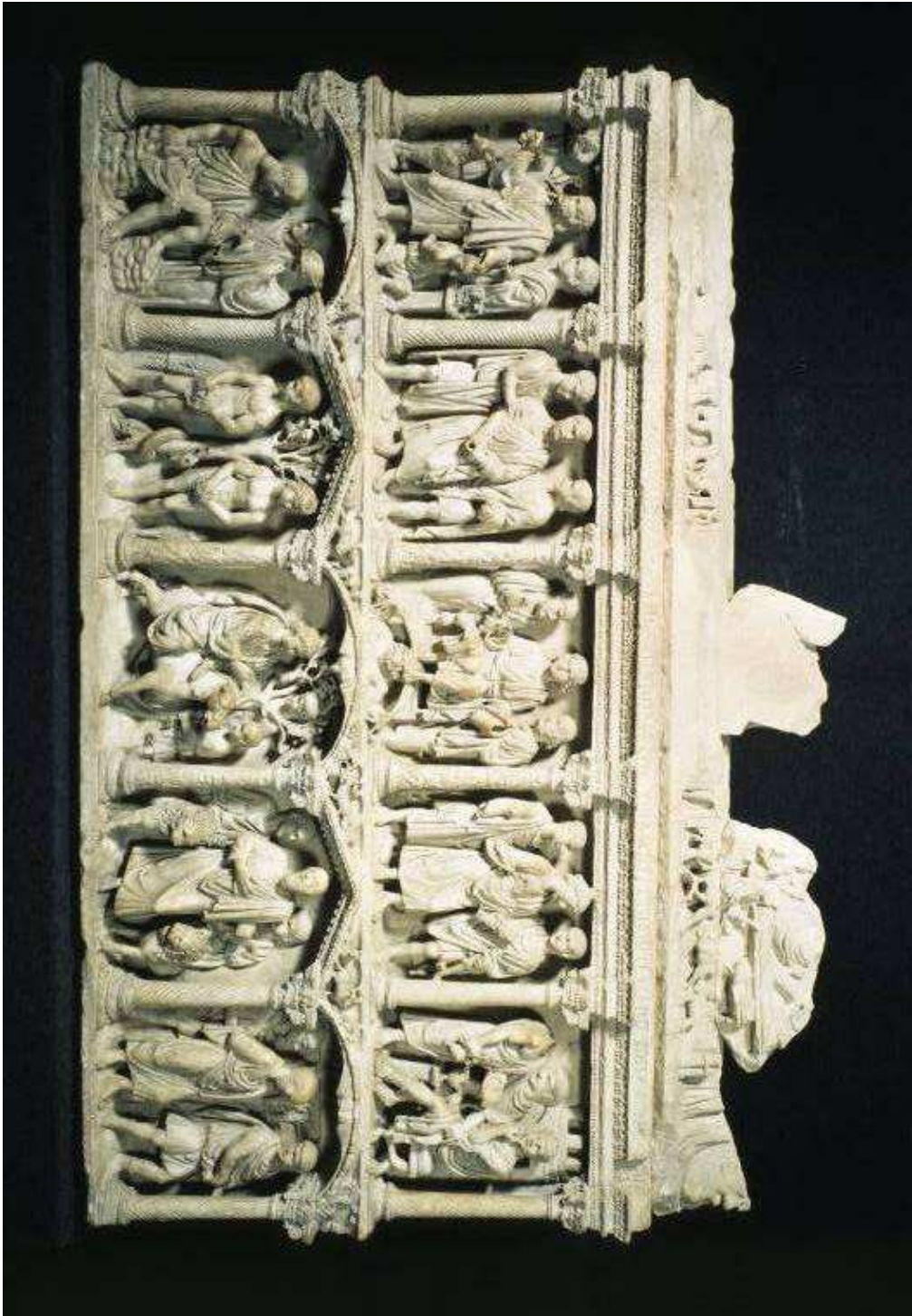
Column sarcophagus of Junius Bassus, marble relief, 359, Museum of S. Peter's Basilica, Vatican, Rome.