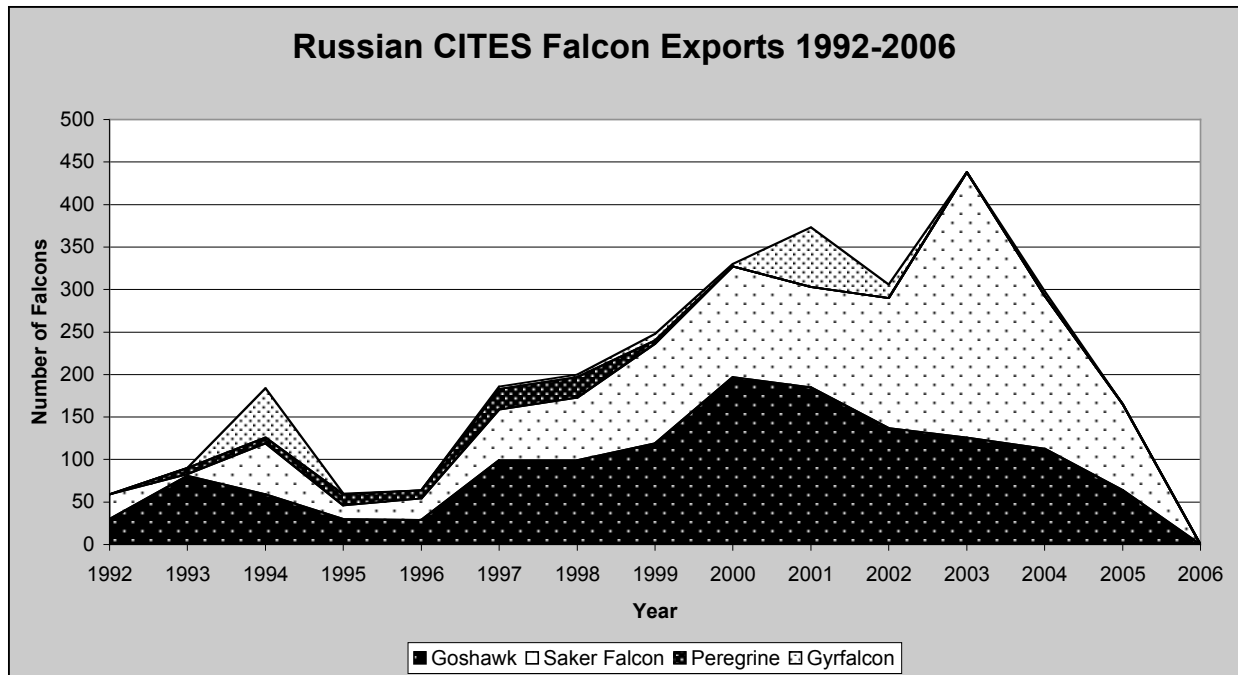
Figure 1 – Source: Adapted from CITES Trade Database managed by UNEP-WCMC

most of the exports was listed as commercial reasons, with some trade for zoos, circuses, breeding in captivity, and personal use. Other birds of prey of particular use in falconry, such as the Peregrine falcon and the Gyrfalcon, had only four captive bred falcons and 130 falcons, 69 of which were captive bred respectively.