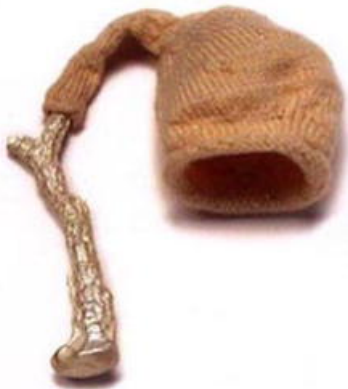
Fig. 1 ‘Afbeelding Omslag’ 1998. Brooch. Wool, silver. Iris Eichenberg

Contemporary jewellery design is primarily concerned with creating objects that are worn or relate to the body and that have emotional content. The fact that jewellery is connected physically or conceptually to the body often situated within the wearer’s personal space, gives it a particular intimacy. Some jewellery makers develop this emotional quality by creating pieces that have personal significance. For example, much of Iris Eichenberg’s work consists of small objects that draw from memory and childhood (Fig. 1). In this piece a knitted container is connected to a silver twig; playfully connecting remnants of events in a way that provocatively challenges existing categories. The unification of the knitted and silver elements creates a particular sensory experience that opens up the very category of jewellery, creating paradox and ambiguity that draw the viewer in. Enchantment is born from the unfinalisable qualities of the piece—it remains a paradox. We can no longer take for granted preconceptions about what jewellery is and we are left wondering about that. Beyond that we are drawn into a very personal story of which we only have fragments. Moreover, wearing the piece can be seen as an active identification with its sensual, emotional, and intellectual quality and with the process of jewellery ‘becoming’. Of course, these layers of engagement, even enchantment, can only start if we respond to the object in such a way that it holds us in a moment of pure presence.