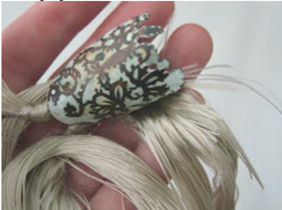
Fig. 6 Necklace “Sometimes” 2004 Jayne Wallace

These fragments are shared through a set of ‘stimuli’, which draw influence from ‘Probe’ sets [18] and project ‘KPZ-02’ (see Bartels and Lindmark-Vrijmann, 2002 at www.projects2realate.net/Interface.swf ).