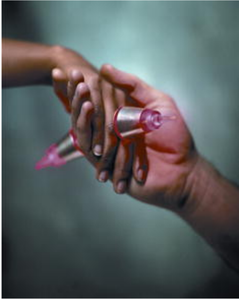
Fig. 4 'For Two Rings' 1994. Magnets, stainless steel, Perspex, LEDs with electronics. Nicole Gratiot Stöber © 1994 all rights reserved