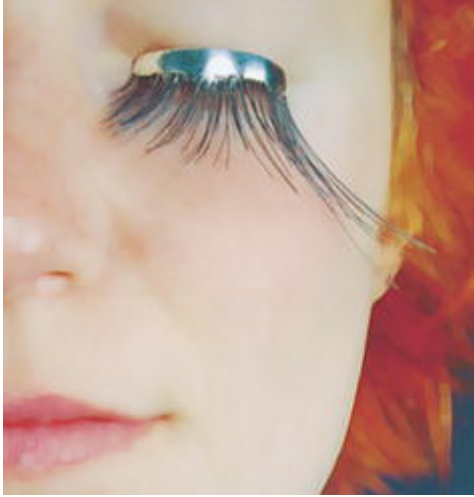
Fig. 2 'Eyelashes' 1999. Jayne Wallace

that masks a sense. A playfulness like the playful masking of the sense of sight to minimise distraction and create a rich space for concentrating on the self. The pieces were designed to counter the idea or experience of fear related to masking a sense by presenting masking pieces that were visually beautiful and comfortable—indicating choice rather than enforcement in wearing the forms.