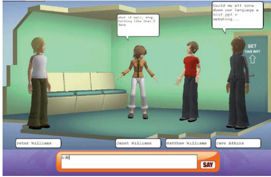
FIGURE 2: Emotional animation and the AI character.