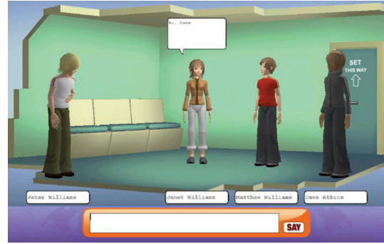
FIGURE 1: Emotional animation.

The approaches we have taken provided some flexibility in the processing and recognition of metaphorical expressions. However, our processing could also be challenged by various variations of these several language phenomena (e.g., “I couldn’t bear to touch the memories”, “he felt his anger rising step by step”, “he was red with anger. I could see the smoke coming out of his ears”, “she was filled