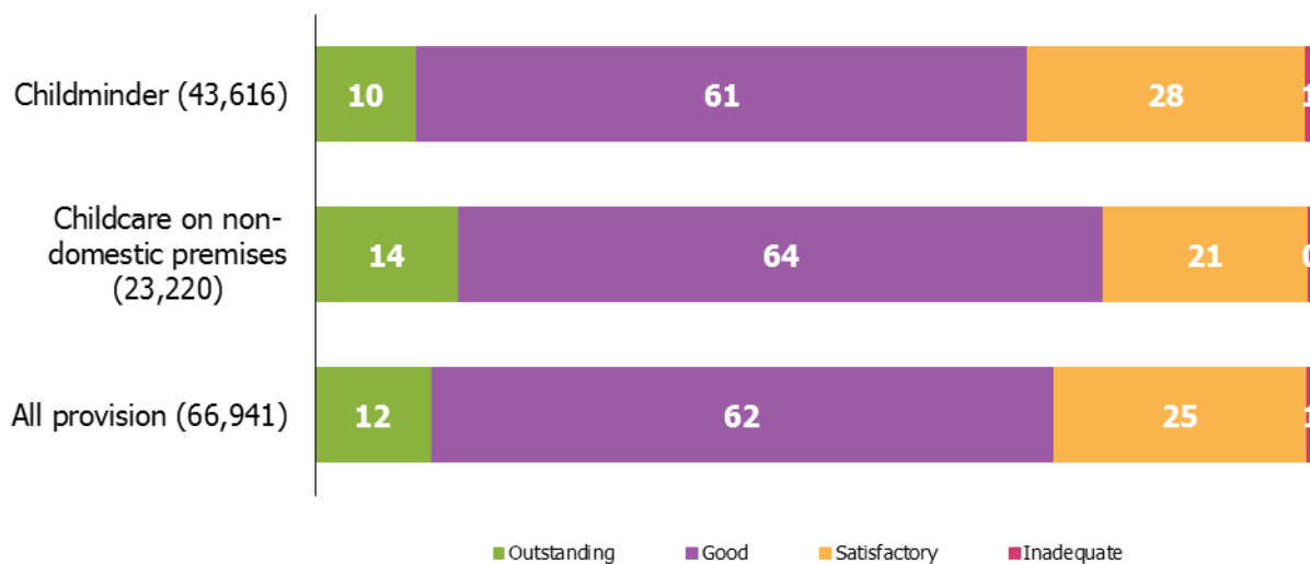
Chart 2: Overall effectiveness of active early years registered providers at their most recent inspection as at 31 August 2012, by provider type (provisional) 1 2 3