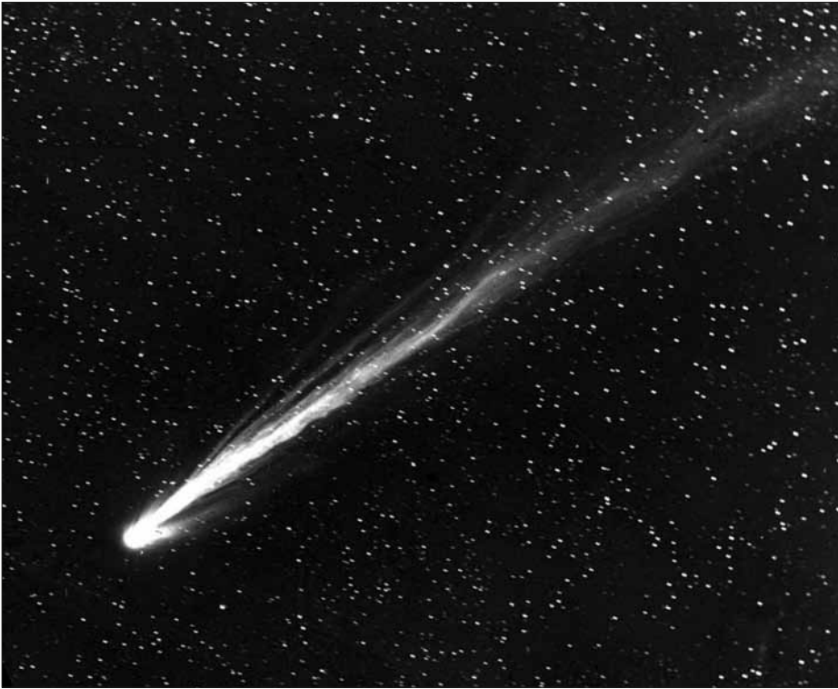
1 Photograph of Comet Morehouse, C/1908 R1. The comet's plasma tail shows signs of detailed structure due to interaction with the solar-wind plasma. At the meeting, Geraint Jones discussed how this plasma tail structure may be used to infer properties of the solar wind.

increasingly sensitive to space-weather phenomena, driven by a general increasing reliance on technological systems (Hapgood 2011). As an example, consider the development of railway systems. At the turn of the 20th-century, railways relied on steam locomotives and manually operated railway switches, both of which were robust against space weather. Now, increasingly, trains are electrically powered, tracks are electrically controlled, and navigation and routing may depend on global navigation satellite systems (GNSS). Each of these factors are sensitive to a range of space-weather phenomena: ground-induced currents (GICs) are a risk to electrical power distribution, while GNSS rely on electronics that can be disrupted by solar energetic particles, cosmic rays and radiation belt particles, as well as effective communication of the GNSS signals, which can be affected by dynamic changes in ionospheric structure and composition during geomagnetic storms.