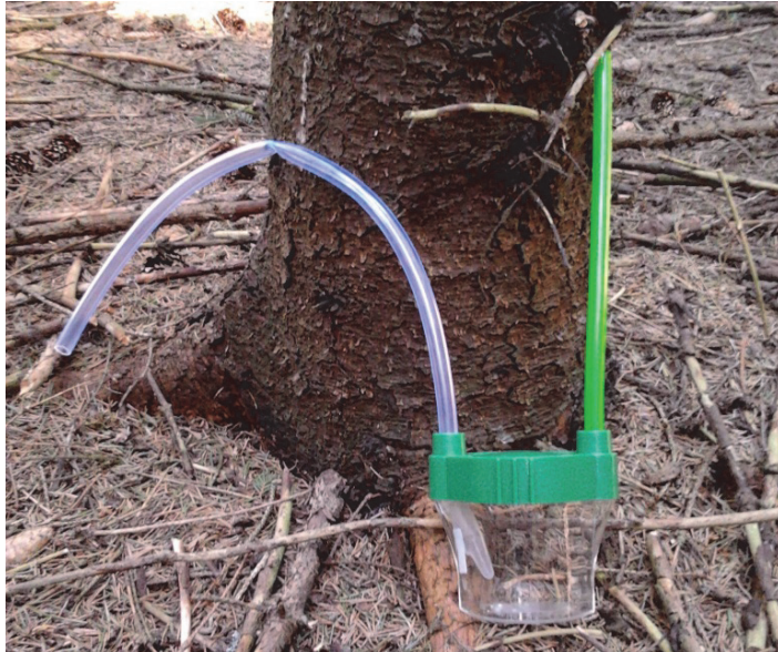
Figure 2. Collection aspirator with Eppendorf tube for a single Collembola individual. The inflow tube (transparent tube) was cleaned with ethanol (96%) after suction of each specimen.

year 2013, study IV included 2013–2015). At least four specimens (max. 9 specimens) of each Collembola species were collected during each sampling period with a single-animal aspirator (Figure 2). The specimens were instantly treated with chloroform to prevent their excretion of gut contents and prepared for molecular (II, IV) and culturing (II) analysis on the day of collection. In addition, study IV included 22 soil samples in order to characterize the local fungal communities from both sampling sites during each collection period (except June 2013). Soil samples were collected and processed following Tedersoo et al. (2014).