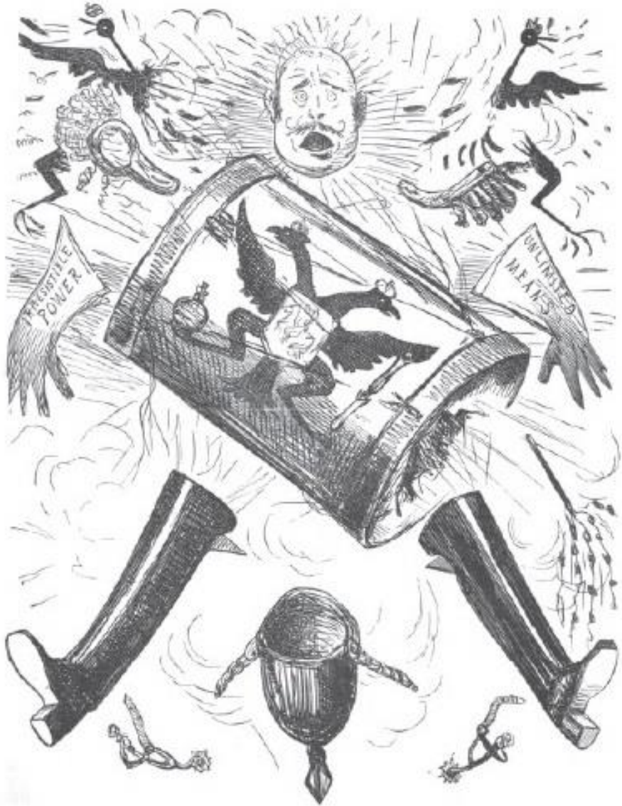
BURSTING OF THE RUSSIAN BUBBLE.

Appendix 6. John Leech "Bursting of the Russian bubble," cartoon Punch vol. 27 (October 14, 1854): 149.