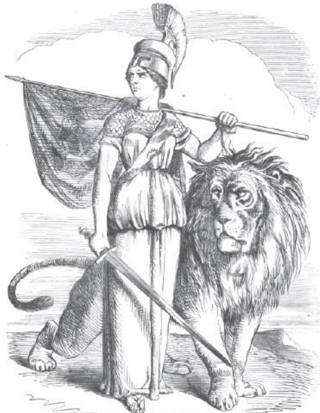
"RIGHT AGAINST WRONG."