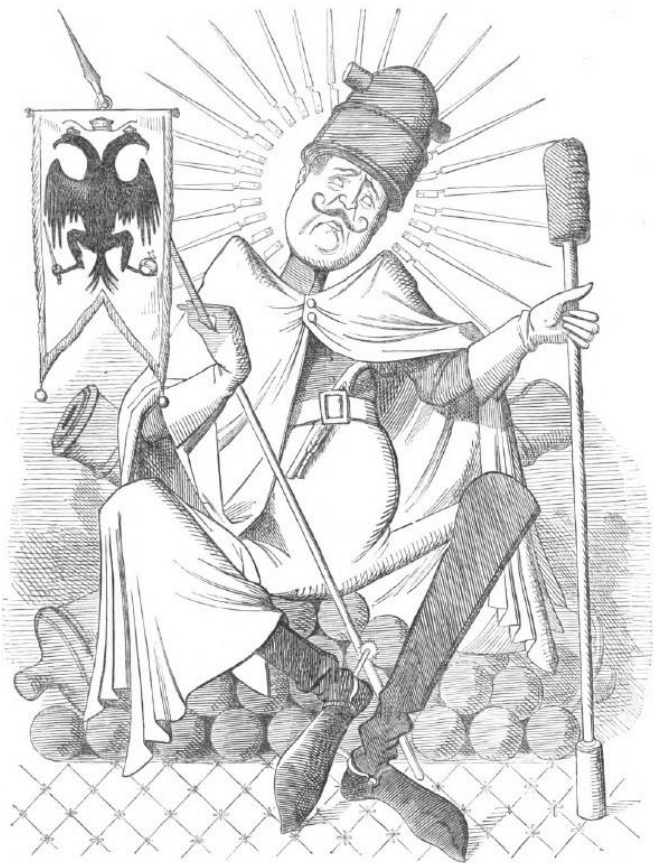
SAINT NICHOLAS OF RUSSIA.

Appendix 5. John Leech, "Right against Wrong," cartoon. Punch vol. 26 (April 8, 1854): 143.