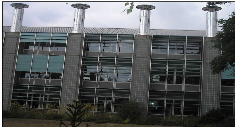
Figure 1. Environmental Office.

An exercise was carried out to revisit the building after around 5 years of operation, review its performance, identify opportunities where further improvements could be made, and generalize these findings to other similar building types.