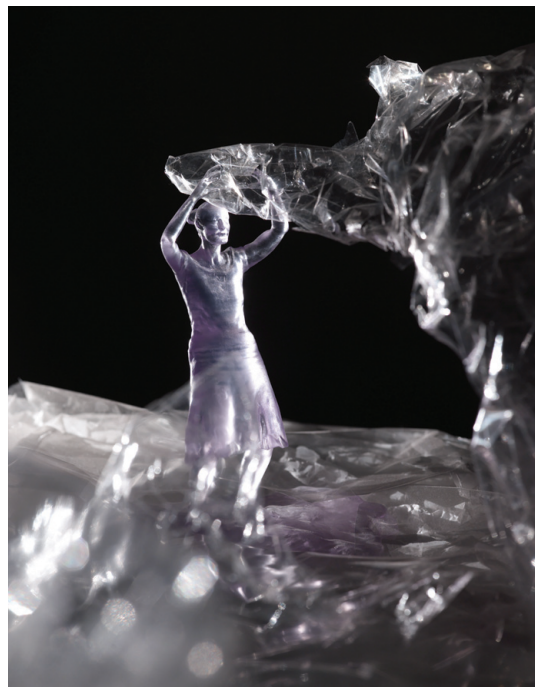
Figure 4. Still Life No. 1 (installation detail), 2011. Polypropylene, 3D printed objects in resin, heights from 7cm to 75cm. Dimensions variable, tabletop 2m diameter. In other uncanny doublings, the artists’ figures appear to hold up sculpted copies of the delicate landscape, standing both inside and outside the transparent forms. © 2011 Brass Art.

This site-specific project uses two forms of light to capture shadows: a medium-format digital camera to capture frozen moments from each scene as “shadows” on the wall, and Microsoft’s Kinect, an on-range camera technology, coupled with custom-built software, to capture the live data from the improvised performance. It was an artistic decision to move our shadows into a new