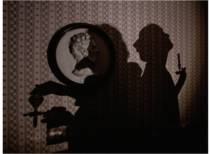
Figure 5. Shadow Worlds | Writers' Rooms [Brontë Parsonage] No. 6, 2011 . Digital print on Hahnemühle Photo Rag, 70cm x 1m. The artists, working with hand-made masks and props, improvised roles to create shadow tableaux to be photographed. The resulting images allude to "a scene unseen" outside the frame of the final image. © 2011 Brass Art.

Having scrutinized the original footage, we further tested some of the scanning parameters, including the effect of reflective surfaces, foil, and mirrors. As artists, we were keen to see if we could disrupt the capture process and influence the likelihood of objects and people appearing and disappearing. As an example, we discovered that the Kinect could not easily