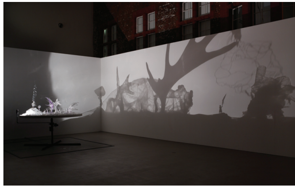
Figure 3. Still Life No. 1 (installation view), 2011. Polypropylene, 3D printed objects in resin, heights from 7cm to 75cm. Dimensions variable, tabletop 2m diameter. This installation view reveals the scale of the 360-degree shadow play. © 2011 Brass Art.

Our approach to the museum collection was eclectic, enabling the formation of our own taxonomies and collections of curiosities for our own ends. We enjoyed the strange illogical relationships that occur between objects not on public display. We were drawn to objects rejected as useful scientific specimens for lack of provenance, the anthropomorphic, the outsized or miniaturized models, the overlooked and outmoded. Our role was as both explorers – responding to unexpected finds and physical phenomena, remaining open to shifts in the outcomes – and directors of a growing number of individuals and companies who worked with us to realize the project.