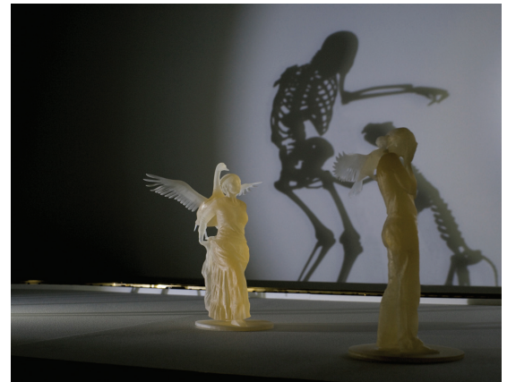
Figure 1. Moments of Death and Revival (installation detail), 2008. 3D printed objects (14 figures, 19cm to 25cm high) in acrylic polymer, train, track, lights, plinth, switch. Dimensions variable. Commissioned for Skyscraping at Yorkshire Sculpture Park, 2008, and shown as part of Concrete and Glass, Hoxton Square, London, 2010. © 2008 Brass Art.

Our artistic practice is informed by ideas of the uncanny (re-animation and the double) and an interest in the limen (thresholds in the real and virtual realms). We return to these themes again and again in our collaborative practice. Our work reveals our long-term fascination with heterotopic spaces – the airport, the museum, publicly inaccessible spaces, as well as culturally loaded spaces [1]. For these reasons we find ourselves, or our doubles, in no-man's land, in imagined realms or occupying well-known collections. The projects described in this paper incorporate our interest in exploring digital technology as a tool for capture and transformation and as a hand-made, improvised, creative response to a situation or space.