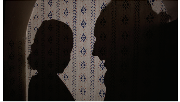
Figure 7. Shadow Worlds | Writers' Rooms [Brontë Parsonage] No. 3 , 2011. Digital print on Hahnemühle Photo Rag, 70cm x 1m. This photograph was captured in the alcove of Mr. Brontë's Study. It reveals an intimate yet ambiguous relationship and demonstrates how the interior architecture of the site distorted and contained the cast-shadow realm. © 2011 Brass Art. Photo © 2011 Brass Art and Simon Pantling.

In capturing the “mise en abyme,” we wanted to reveal the whole scene, the entire improvised performance, including the photographer [16], the Kinect director [17], the museum curator, and surrounding artifacts using two distinct time-based technologies. As Descartes wrote: “What do I see . . . but hats and cloaks, which can cover ghosts or dummies who move only by means of springs?” [18]. What is interesting and disorienting about the process is that the shadows cast by our figures (both disguised and simply “being”) and seen by the lasers are entirely unseen by us during the process. They are also different to those captured by the lens of the medium-format camera. The two approaches we have used offer different perceptions of the space. The photographs allude to “a scene unseen” outside the frame (Figure 7). The video reveals that scene but simultaneously records “an unseen shadow realm.” The juxtaposition of the works might lead the viewer to question their perception of the space, just as Descartes questioned his perception of an ordinary view.