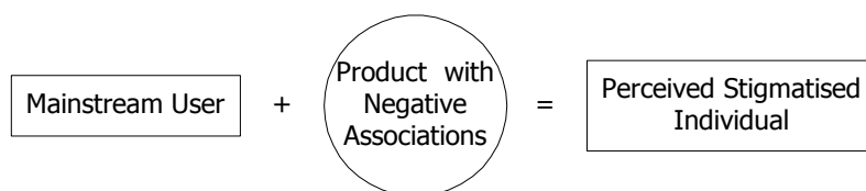
Figure 6. How applying a negatively associated product to a mainstream user alters perceptions of others

A number of disability awareness groups advocate the use of existing assistive technologies such as wheelchairs, white canes etc. that allow able bodied individuals to be placed in the position of the stigmatised, through the association of the product (Figure 6).