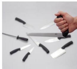
Figure 10. IKEA 365+ bread knife

These products use a functional element designed to aid users who require physical assistance, yet have a proven appeal within mainstream society due to the advantage that the functional element provides. This increased functionality may be due to the fact that when designers apply their thought to a specific functional problem, an innovative solution may well follow. The IKEA 365+ bread knife is an excellent example of how a product intended for a stigmatised user group (those with dexterity issues) can be adopted by the mainstream due to increased ease of use.