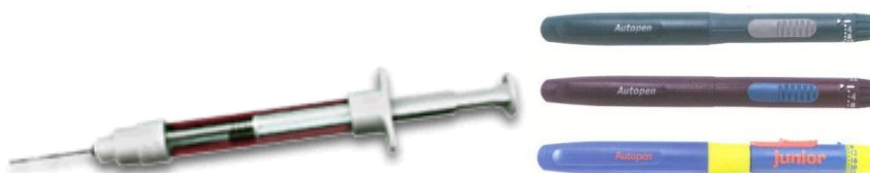
Figure 8. A needle of the type traditionally used to administer insulin and a modern “pen” type needle

This type of product breaks down the negative aspects associated with the functionality through the application of mainstream characteristics. When dealing with taste it must be stressed that subculture analysis dictates that tastes vary across different segments of society. The types of products that consumers choose to surround themselves with has been referred to as TasteSpace [8], which reflects the image that the consumer wishes to portray. However, there are common elements that transcend subcultures, so mainstream taste is defined here as the more common elements (Figure 8).