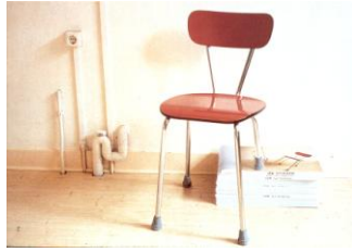
Figure 9. A chair from the “Do Add” series of furniture by Jurgen Bey