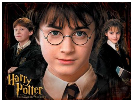
Figure 1. Harry Potter wearing his glasses.

As well as using the stigma, sometimes it is artefacts that carry the negative association that are adopted. One example being Harry Potters glasses (Figure 1). This style of eyewear were supplied by the NHS in Britain and for a long time had a negative association as being poor quality products for users that could not afford a nicer pair, but such was the desire to emulate their role model that young children were lying to their parents about having vision problems, just so they could go to the opticians and acquire a pair of glasses just like Harry’s [6]. It is through this adoption that the product loses some of its negative association, through acquiring new ones.