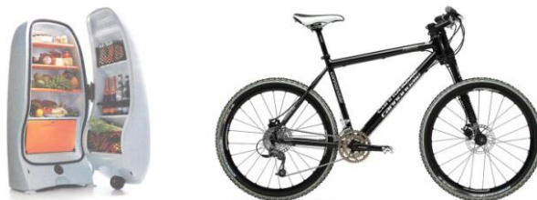
Figure 5. The Zanussi OZ23 fridge-freezer and the Cannondale F2000.

Another approach that is similar is the emergence of Organic or Naturalistic design [6]. These are approaches to design that embrace a non-technical and non-threatening approach to forms. Typical features are asymmetry and natural finishes (Figure 5).