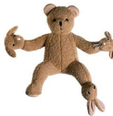
Figure 4. Philippe Starck's "TeddyBearBand".

An example of this first approach is Philippe Starck's "TeddyBearBand" (Figure 4). The bear could be interpreted in two ways. The first is that the bear has brought along its friends to play. The second is that the bear is teaching children that there is no set format that we should expect people to come in.